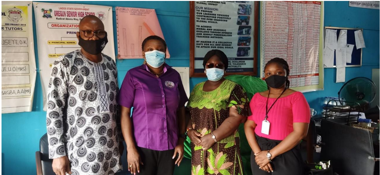
Visit to Oregon Senior High School for Rapid Assessment Visit on Wednesday, January 13, 2021

WARIF Centre 6, Turton Street off Thorburn Avenue Yaba, Lagos Email - info@warifng.org Telephone (+234)-809-210-0008