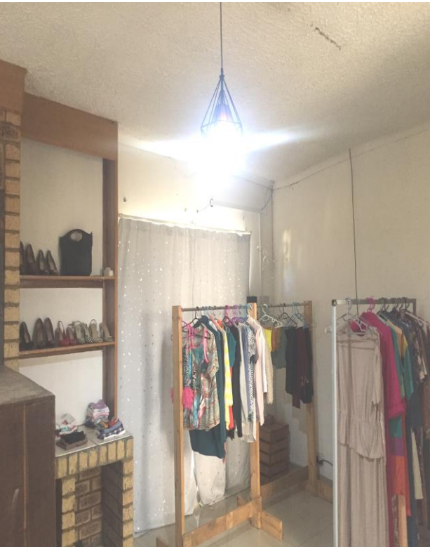
THE THRIFT SHOP