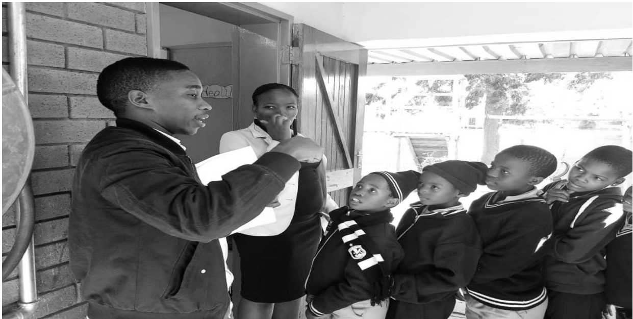
BEFORE CLASS CHECK INS WITH STUDENTS