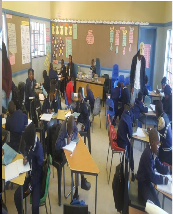
LITERACY AND ARTS AND CRAFTS PROGRAM UNDERWAY