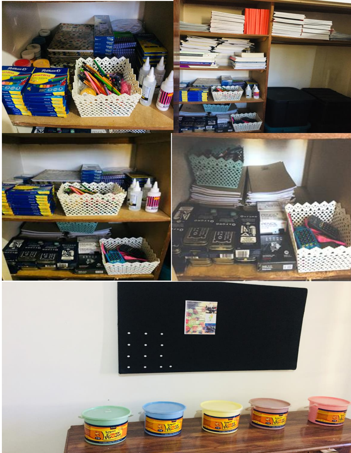
LITERACY AND ARTS AND CRAFTS PROGRAM SUPPLIES