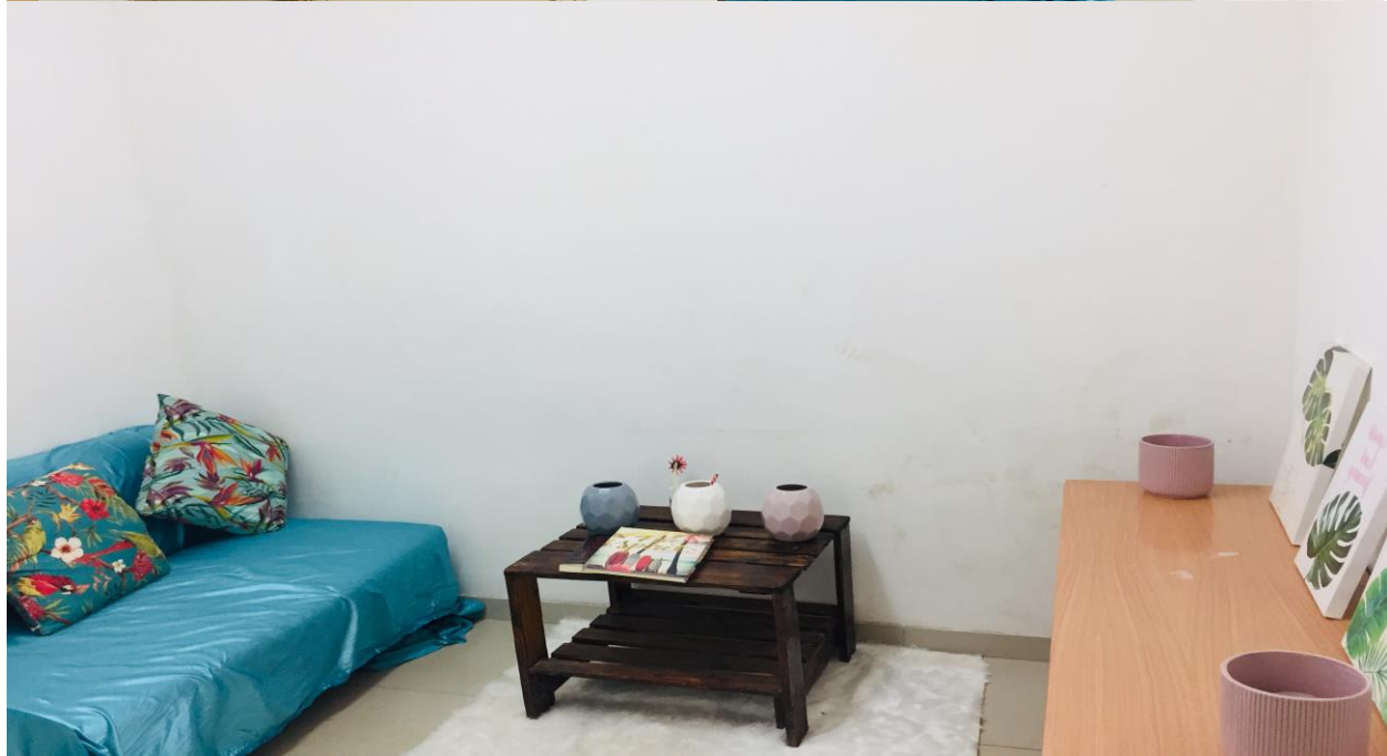
BEAUTY SPA AND COSMETICS ROOM