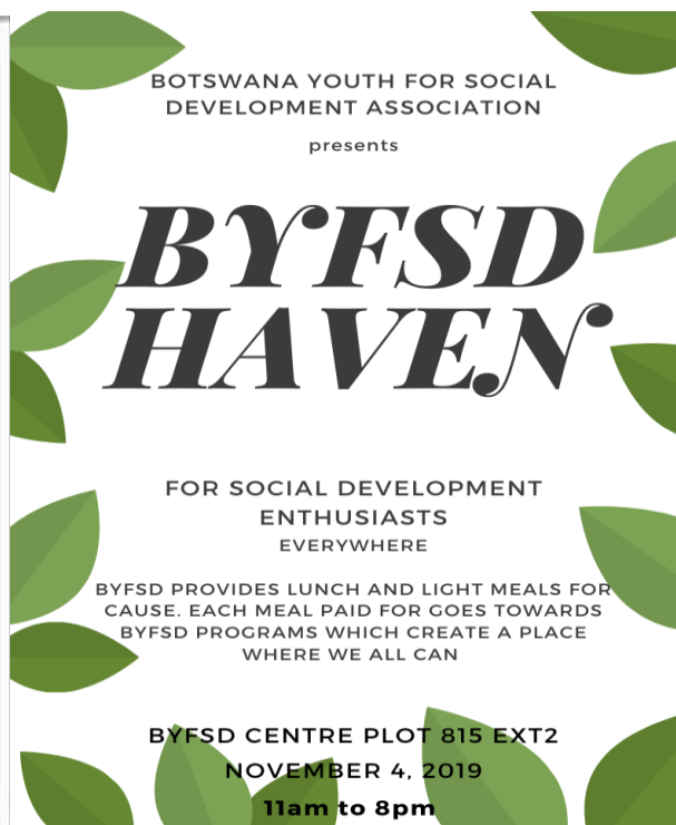
PROGRAMS AND FUNDRAISING FLYERS