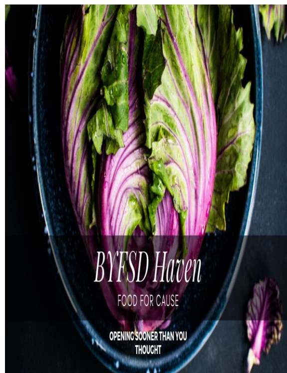
PROGRAMS AND FUNDRAISING FLYERS