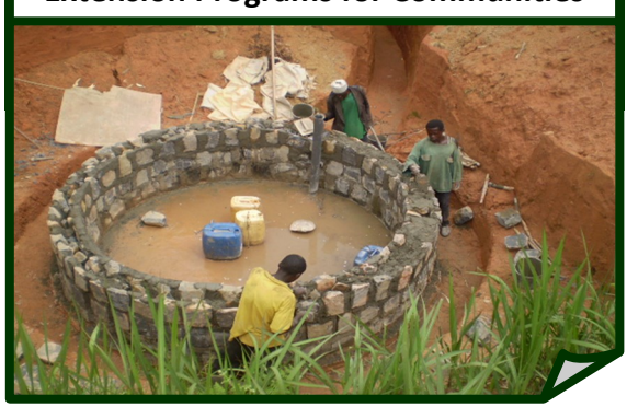
V. Hygiene and Sanitation/Water Extension Programs for Communities