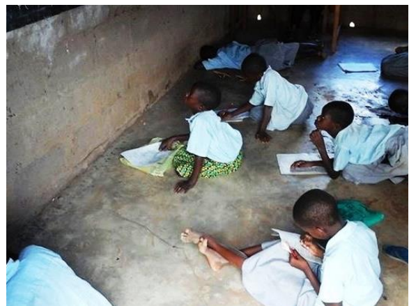
Photos of the existing school

"I was shocked by the contrast with those schools I had seen before. It was stepping back in time. Buildings that should probably be condemned, classrooms that were dark, dusty and with simple mud floors. Little or no furniture for the children. Classes hopelessly overcrowded. It's difficult to imagine the children believing that education is important when nobody cares for the learning environment. From a personal viewpoint, I couldn't take any photos simply because I was so embarrassed by what I saw. It was this visit that really clarified my understanding of the transforming quality that African Promise delivers."