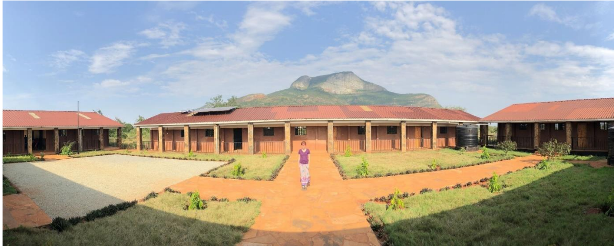
Ngambenyi Primary School

With over 10 years' experience working in this field we have earned a reputation as one of the leading school-development charities in the region. Our most recent partner school, Ngambenyi Primary (pictured below), has been declared a 'model' school by the local county government following our two-year, £110,000 redevelopment and it is widely regarded as one of most child-friendly and well-equipped schools in the county, eclipsed perhaps only by those that have been constructed by the Chinese!