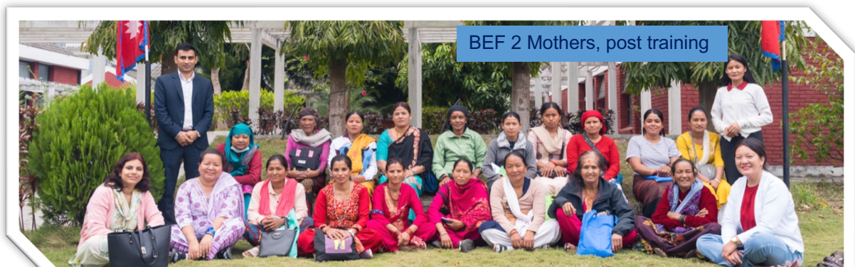
BEF 2 Mothers, post training

There is still much to do. But the foundations are solid, and the direction is clear. The “ Social Sustainability Project ” is more than an economic initiative, it is a commitment to dignity, independence, and opportunity for single mothers and their daughters. It is BEF's practical response to poverty and exclusion, and a meaningful step toward the world we are working to build.