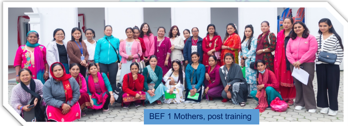
BEF 1 Mothers, post training