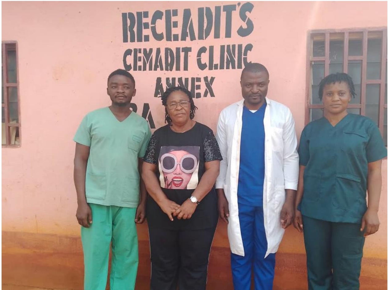
Our Medical Team at Our RECEADIT-GlobalGiving Clinic at the remote, rural Community at Bassamba.