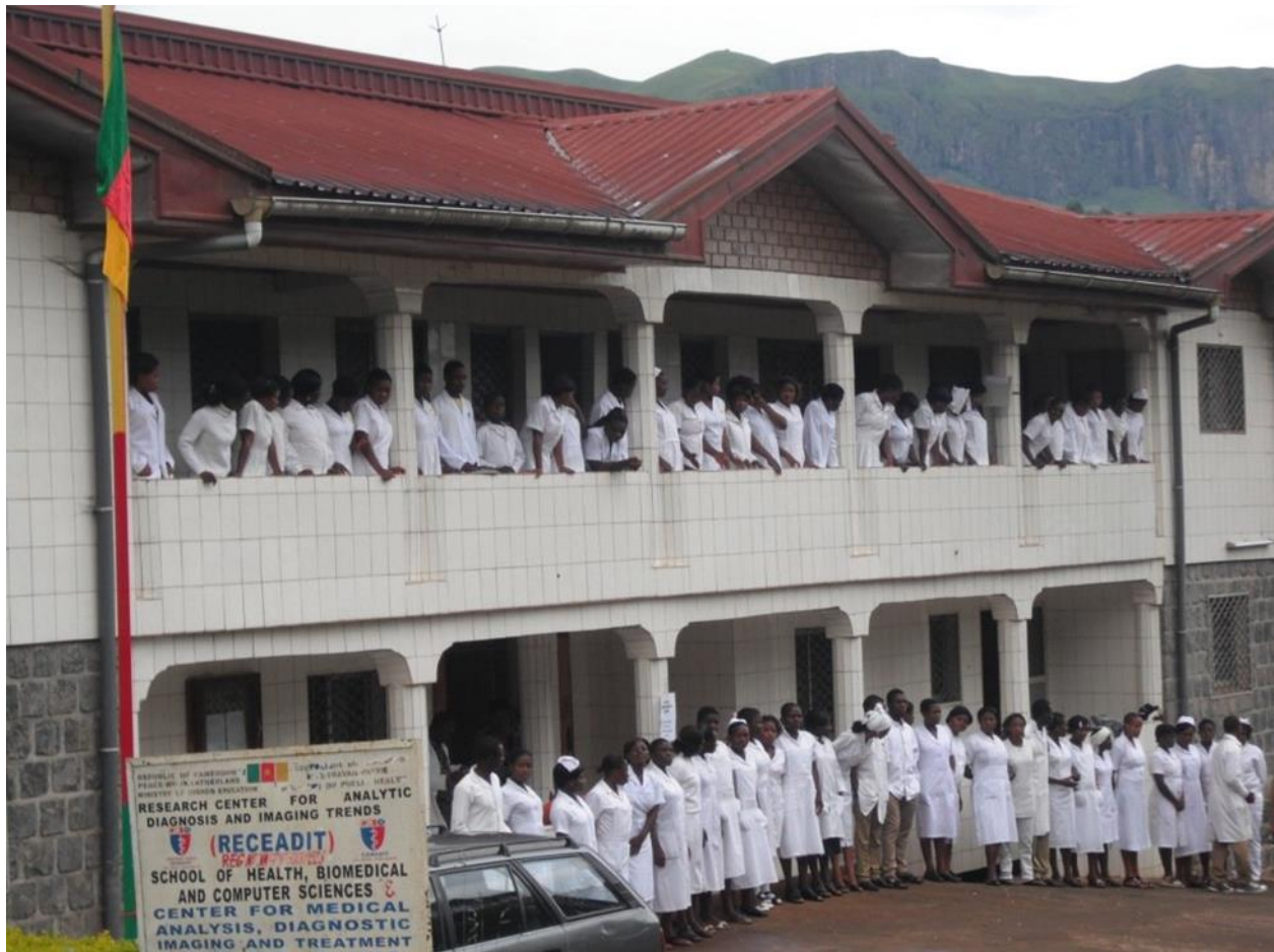
Research Center for Analytic Diagnosis and Imaging Trends (RECEADIT) School of Health, Biomedical and Computer Sciences (SHBCS)