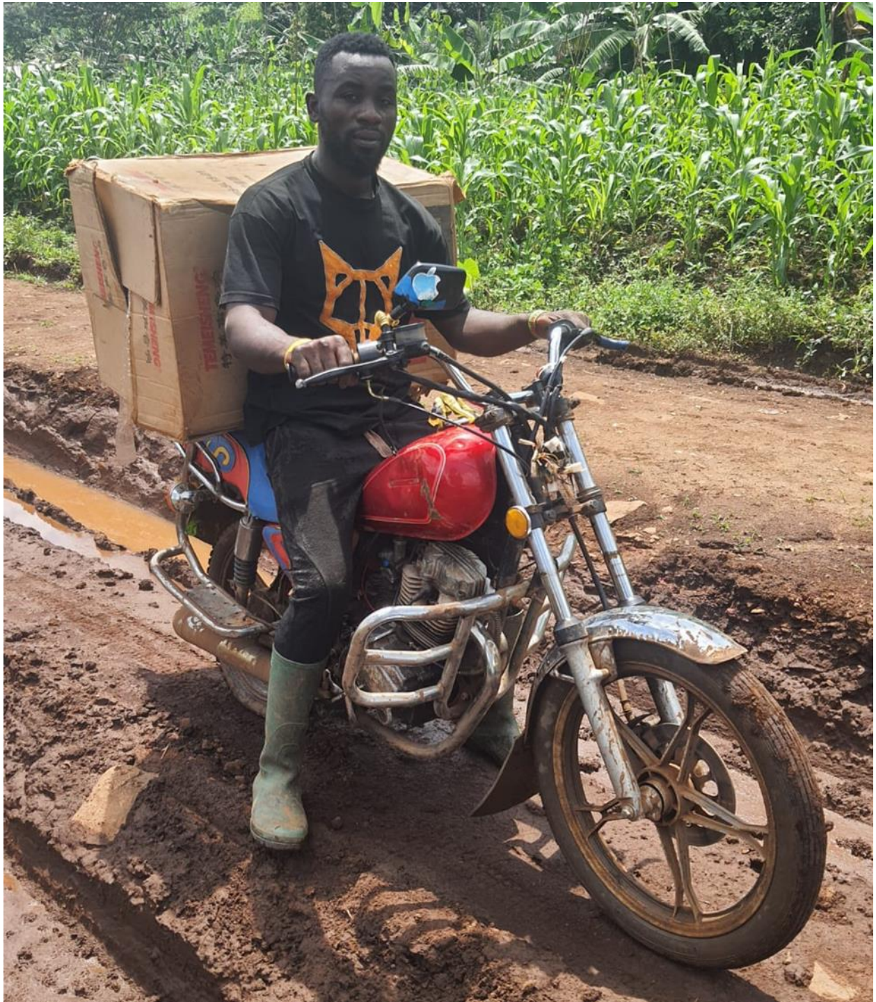
One of Our New RECEADIT transporting Drugs, Mosquito nets, Food Items and Medical Equipment to Our RECEADIT Clinic at Muteff remote, rural community