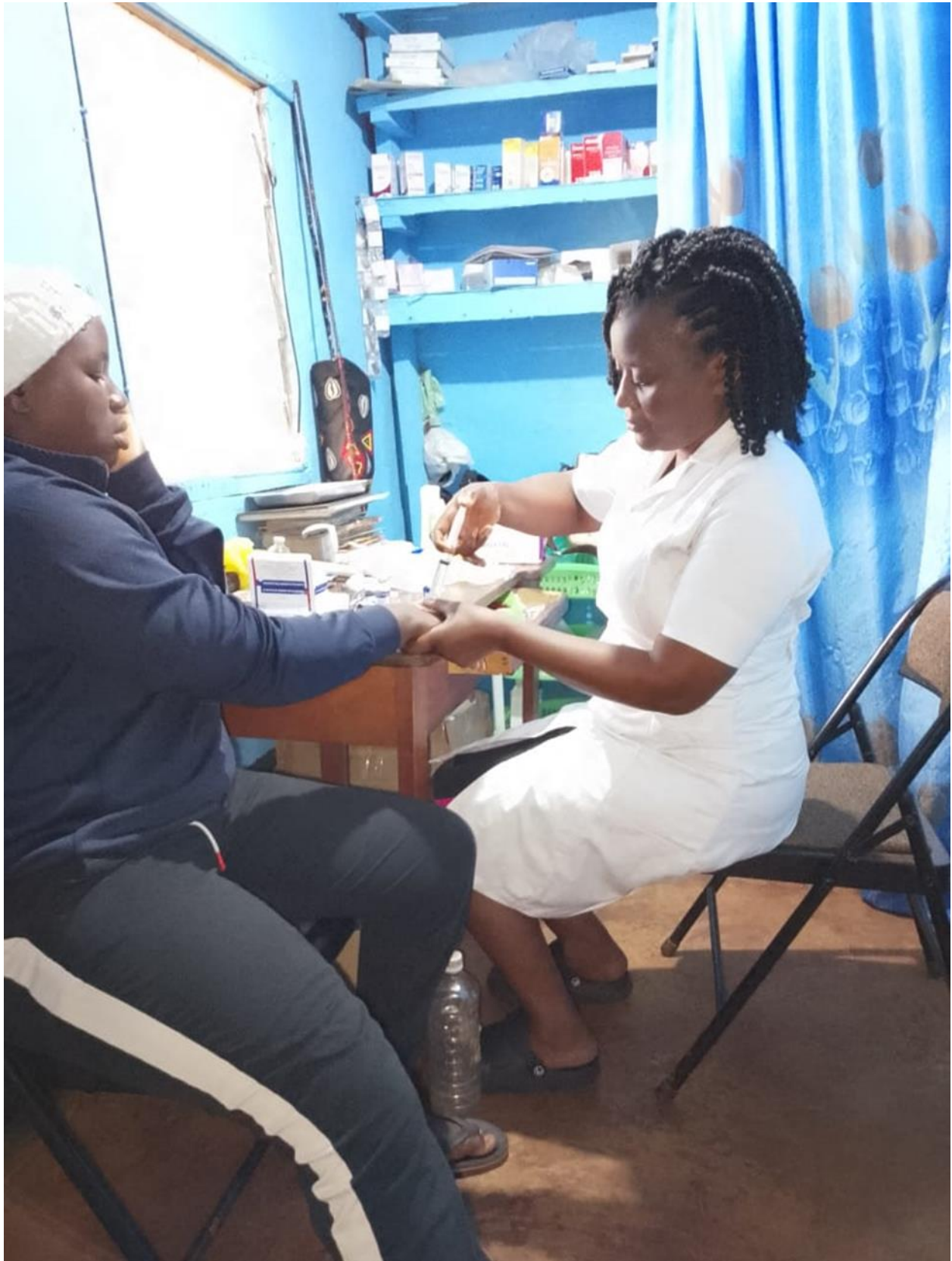
Our female nurse attending to her patient at Our RECEADIT-GlobalGiving Clinic at the remote, rural Community at Bassamba.