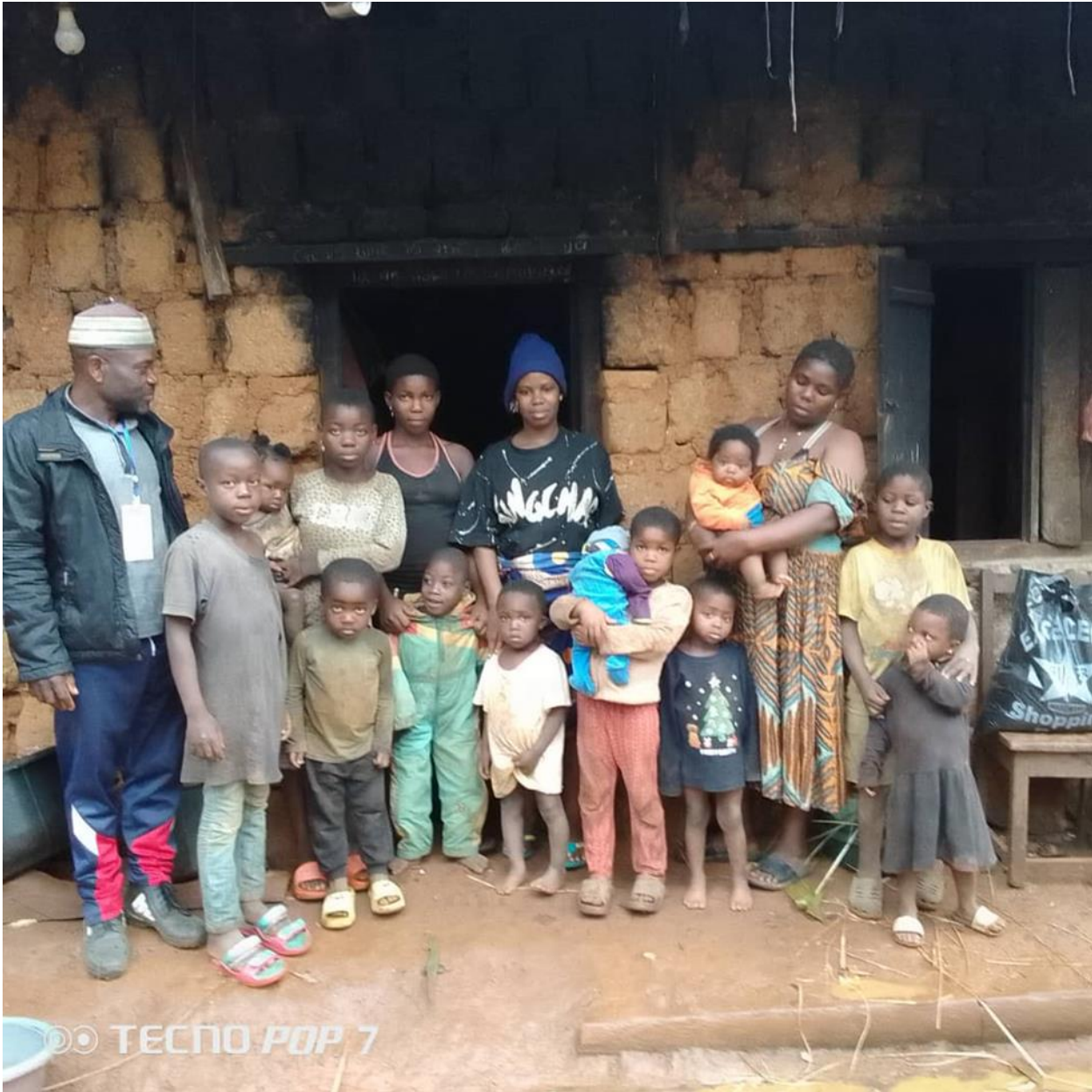
Our RECEADIT-GlobalGiving Partnership Medical Team on its Home Visits Program, after attending to our Internally Displaced school children and their parents at Mbam remote, rural Community where Our RECEADIT Clinic is located.