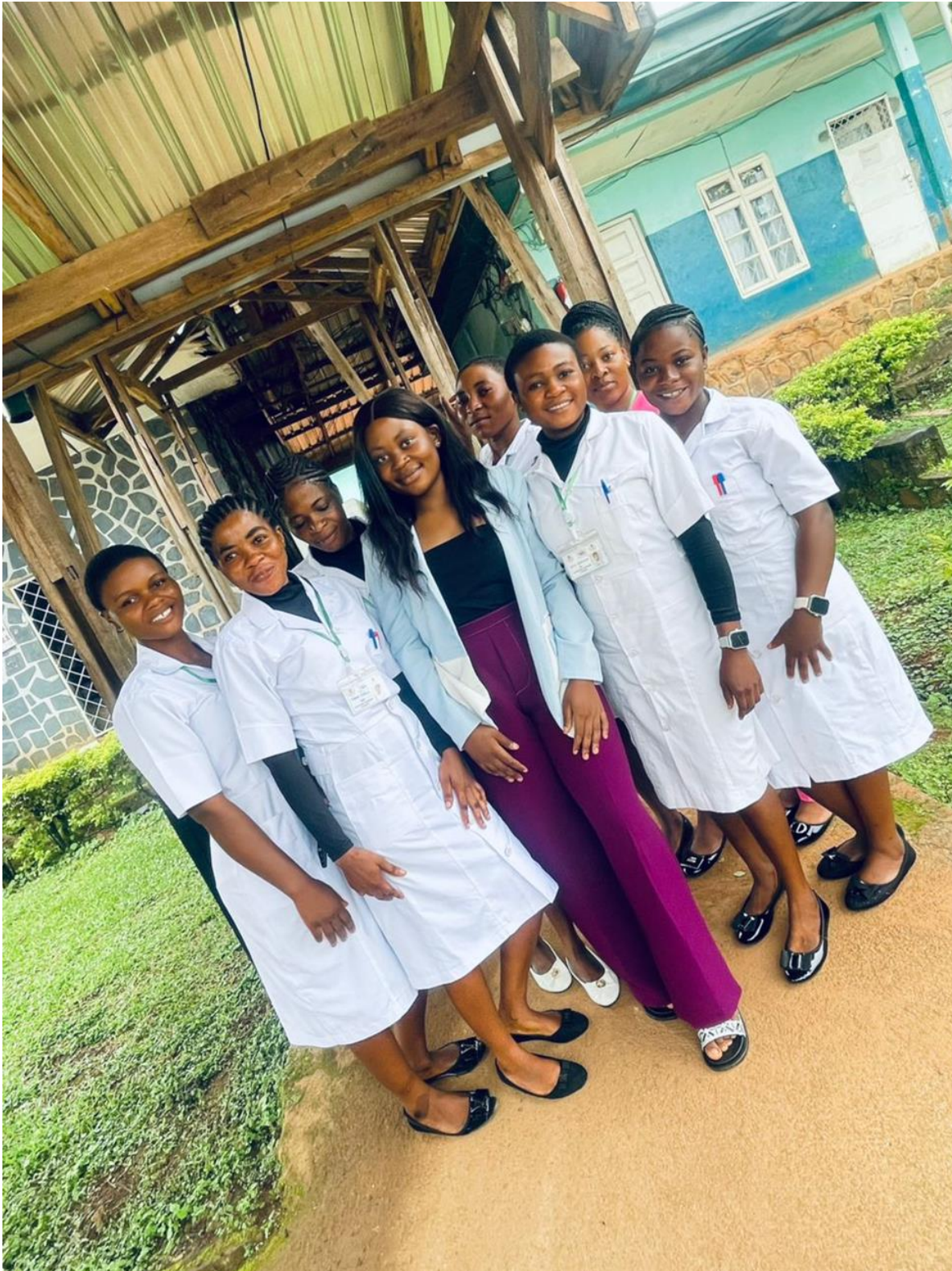
First Photo of Students of Our New Higher Institute of Health and Management Studies (HIHMS), in front of Our New Higher Institute of Health and Management Studies (HIHMS) Building at Kitchu. getting prepared and ready for their Internship Sessions at different Hospitals in Fundong Division.