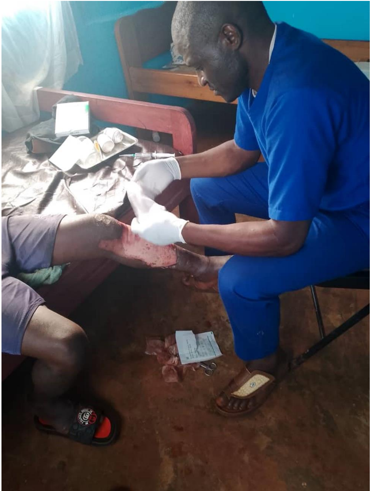
Our male nurse attending to his patient at Our RECEADIT-GlobalGiving Clinic at the remote, rural Community at Bassamba.