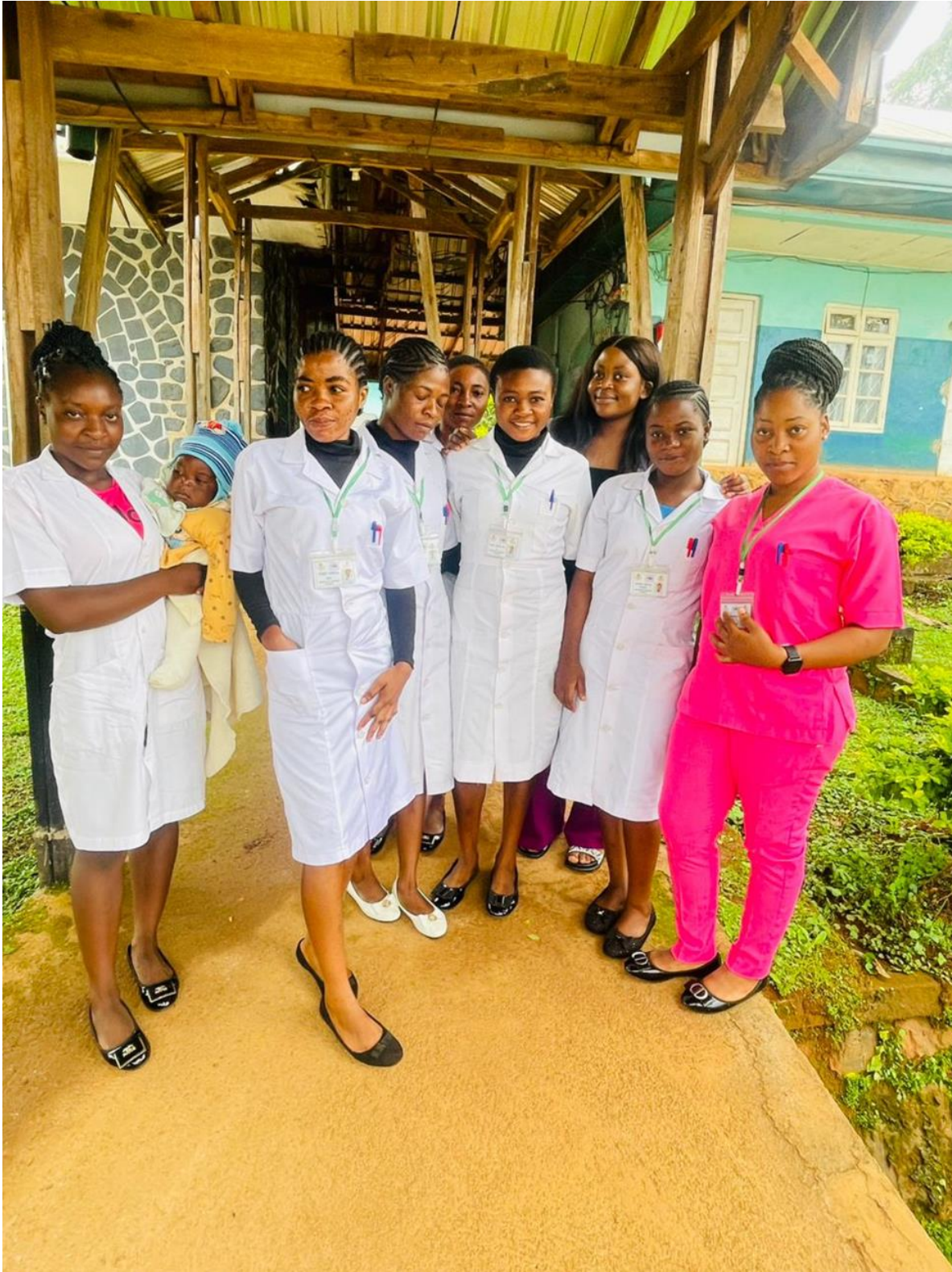
Second Photo of Students of Our New Higher Institute of Health and Management Studies (HIHMS), in front of Our New Higher Institute of Health and Management Studies (HIHMS) Building at Kitchu. getting prepared and ready for their Internship Sessions at different Hospitals in Fundong Division.