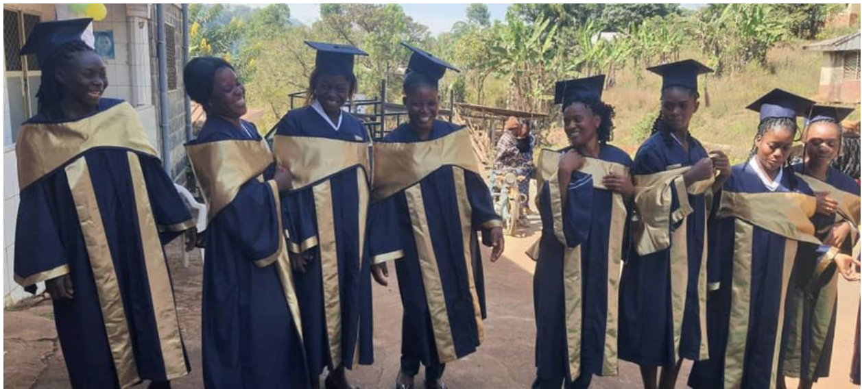
Graduating Students of Our New Higher Institute of Health and Management Studies (HIHMS), celebrating their graduation on December 27, 2025 in front of Our New Higher Institute of Health and Management Studies (HIHMS) Building at Kitchu.