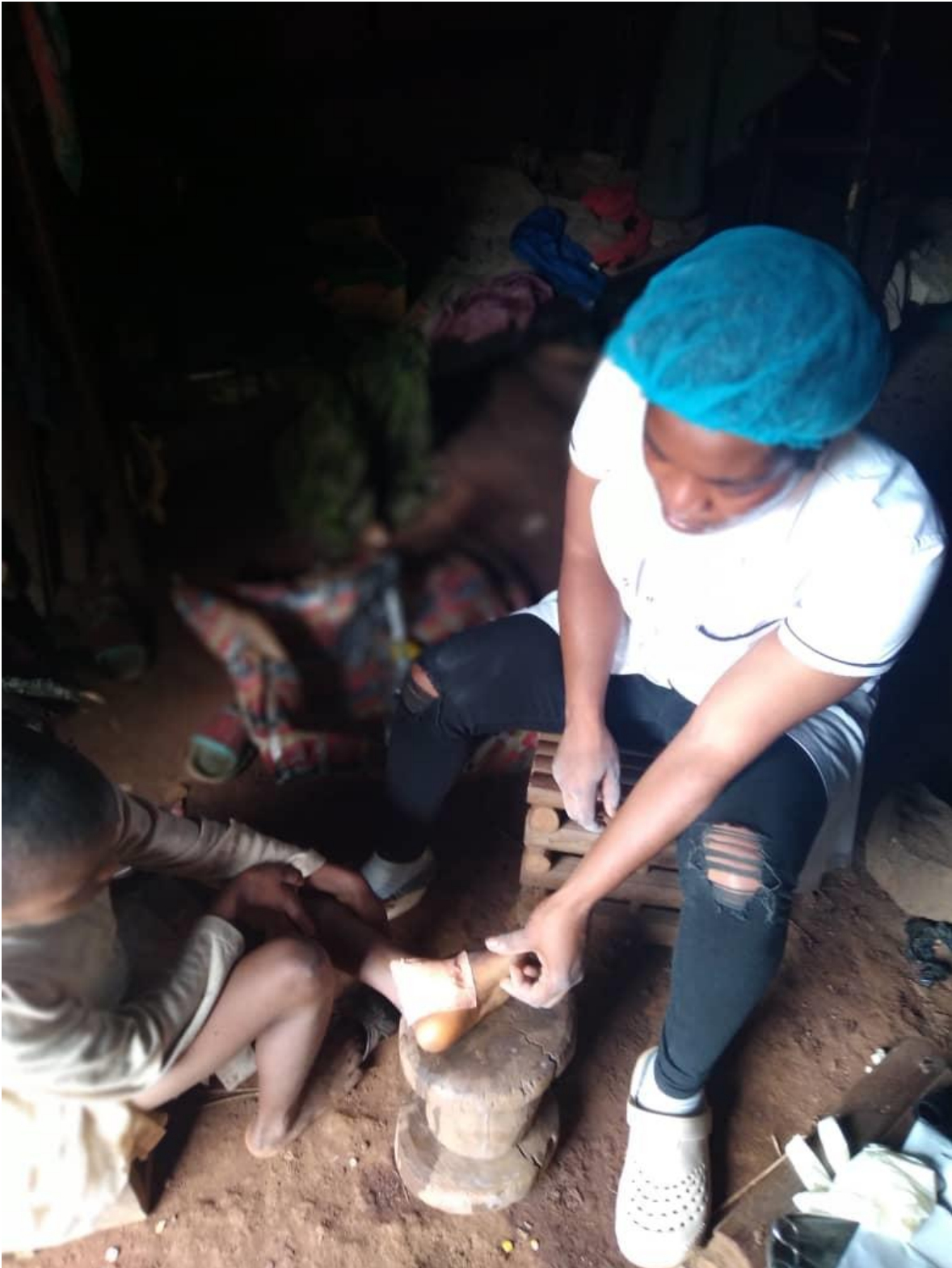
Our RECEADIT Female nurse, on her follow up Home Visits Program, attending to one of our Internally Displaced female patient at Ngemsibo remote, rural Community where Our RECEADIT Clinic is located.