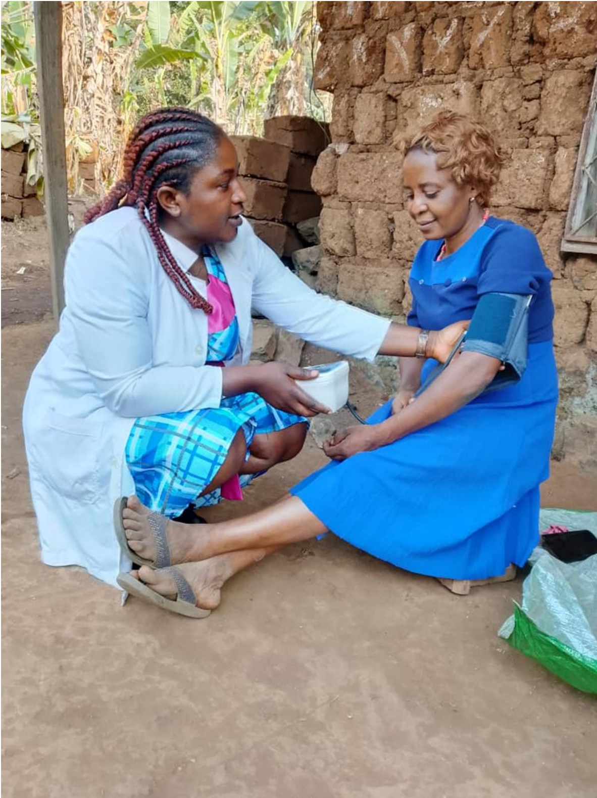
Our RECEADIT Female nurse, on her Home Visits Program, attending to one of our Internally Displaced Female patient at Muteff remote, rural Community where Our RECEADIT Clinic is located.