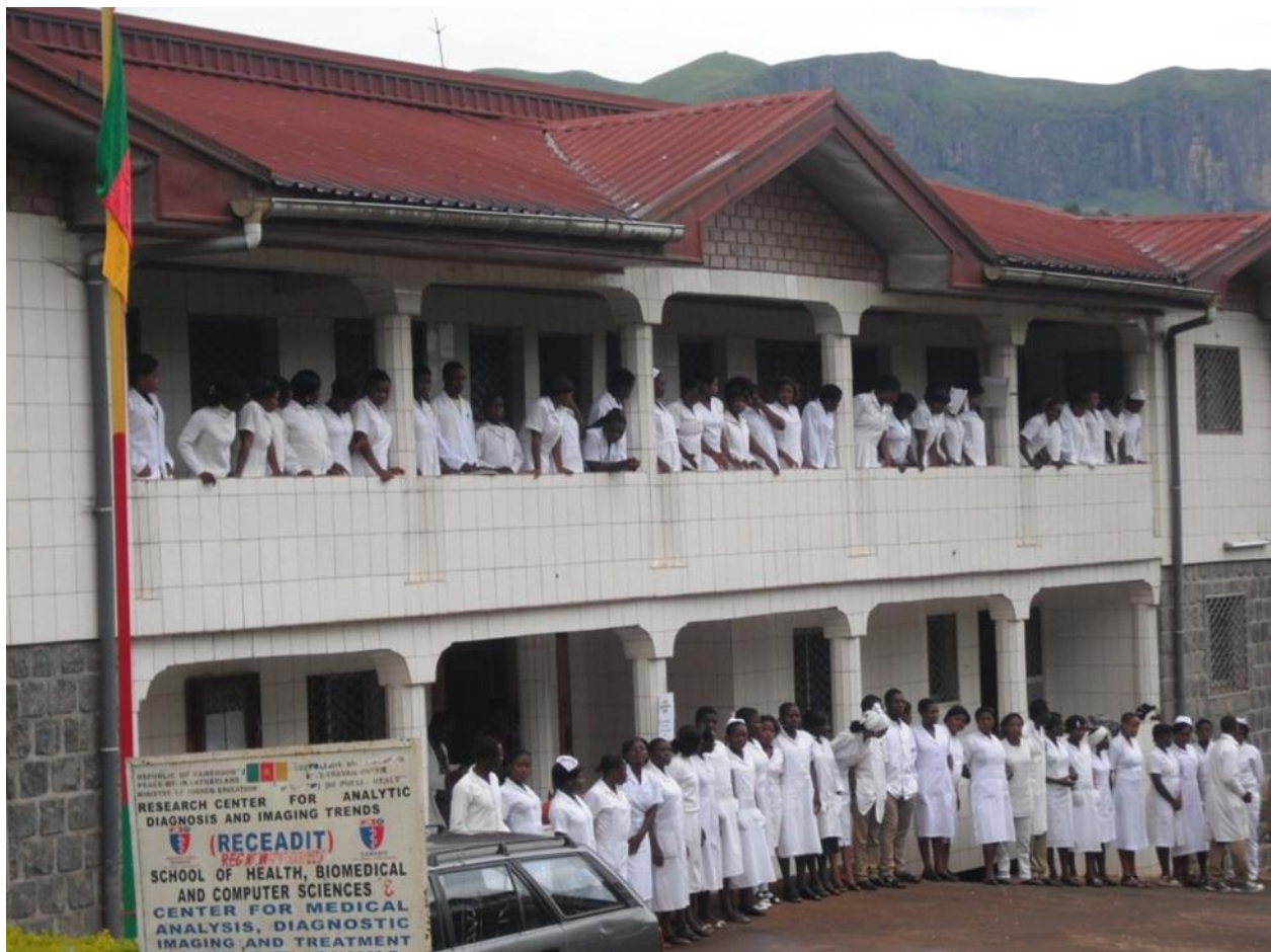
Research Center for Analytic Diagnosis and Imaging Trends (RECEADIT) School of Health, Biomedical and Computer Sciences (SHBCS)