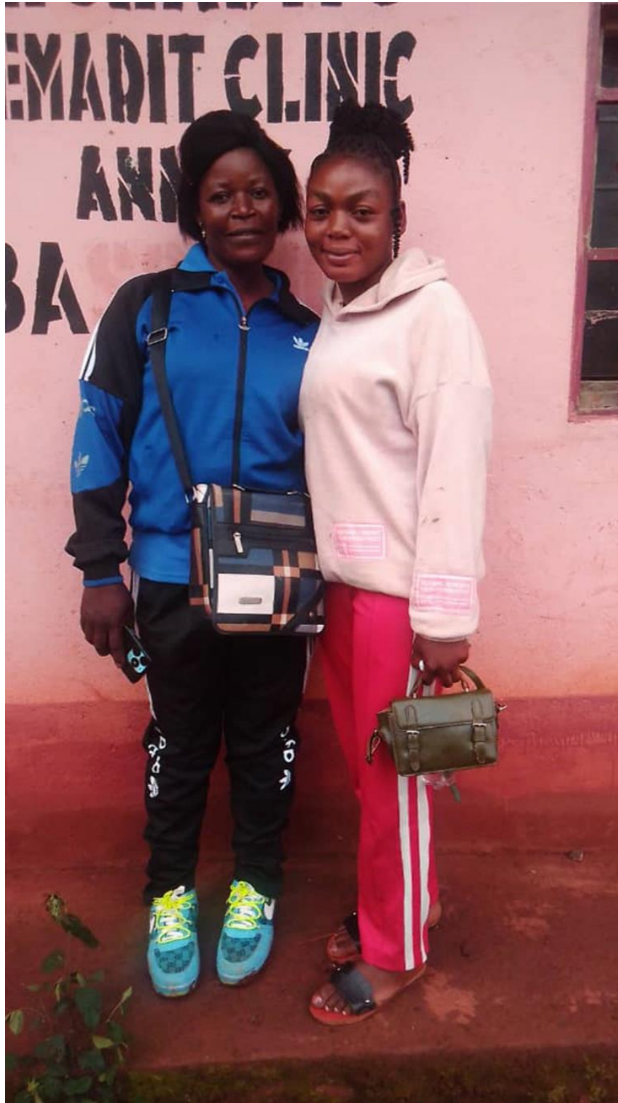
Two graduates of Our New Higher Institute of Health and Management Studies (HIHMS) who have now been employed as RECEADIT Medical workers at Our RECEADIT-GlobalGiving Clinic at Bassamba.