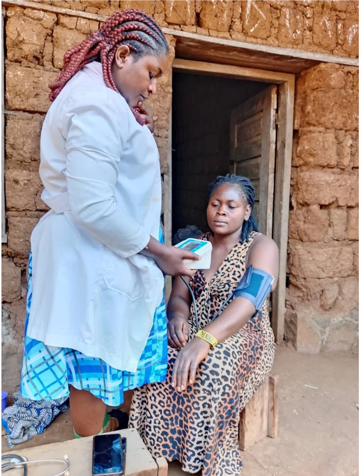
RECEADIT Female Nurse with her favorite female Internally Displaced patient who has made it her routine practice to return monthly for her medical follow up at our RECEADIT - GlobalGiving Partnership Clinic at Muteff Remote, Rural Community.