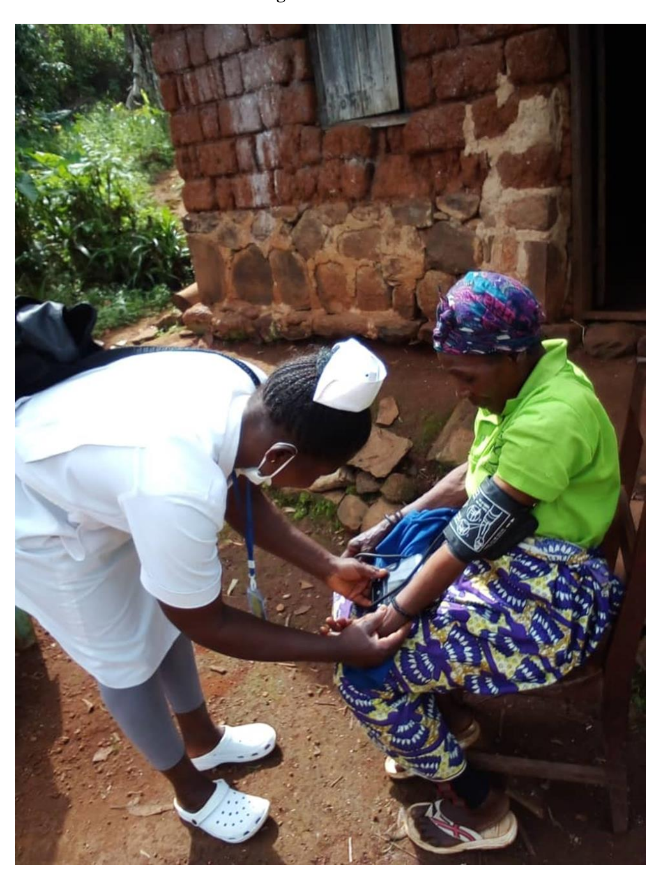
RECEADIT Female nurse attending to an elderly patient during her Home Visits Program within the Kitchu Community where Our RECEADIT Clinic is located.