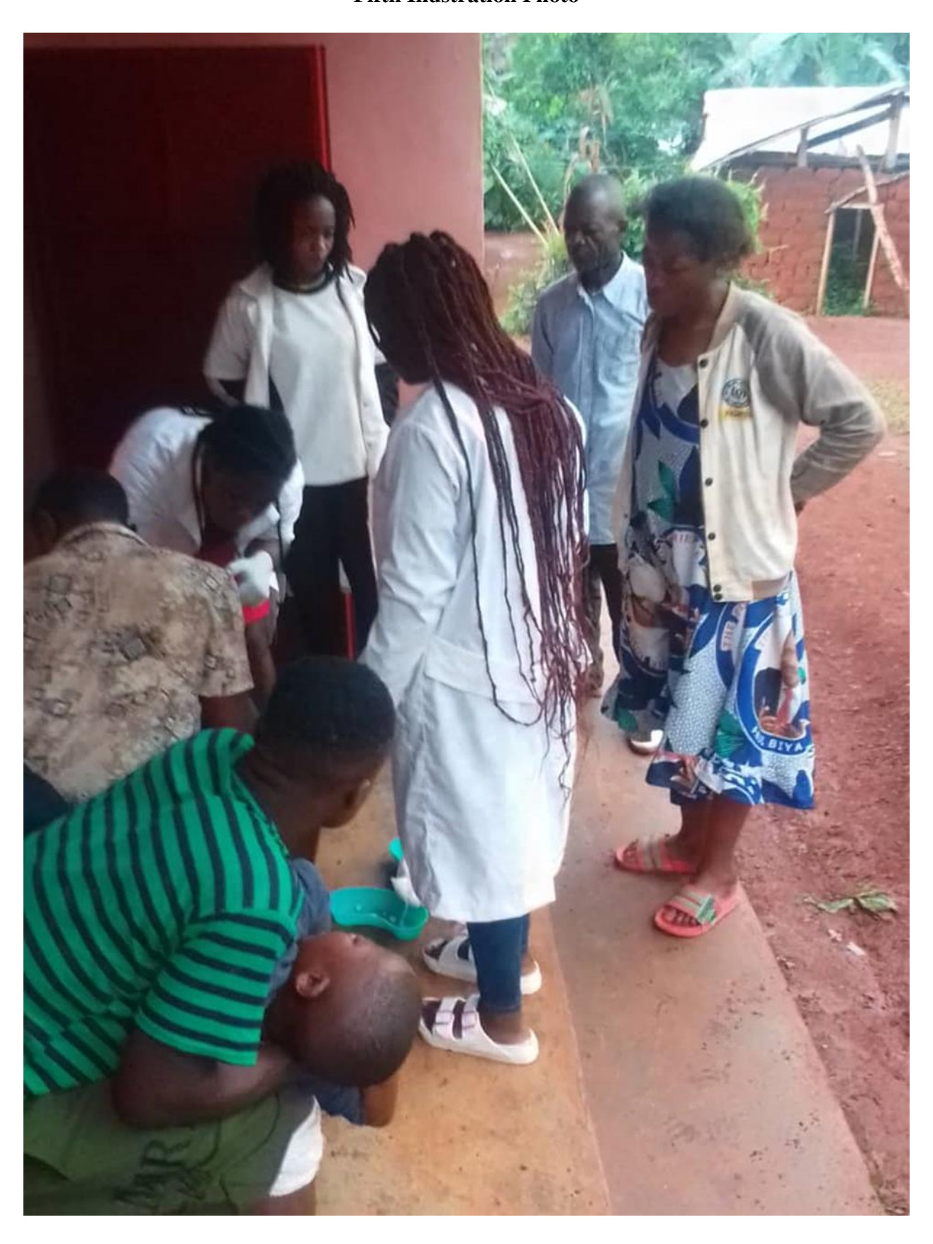
RECEADIT Three Female Nurses With four of their Internally Displaced Peoples who have just received medical treatment and are having their children vaccinated at our RECEADIT's CEMADIT Clinic Annex-at Bassamba Remote, Rural Community.