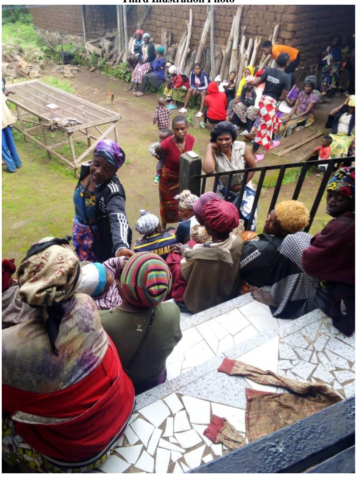
Third Illustration Photo

Our Internally Displaced People within the Muteff Remote, Rural Community where Our RECEADIT-GlobalGiving Health Center is located, waiting for their Monthly medical examination and food assistance from our RECEADIT Medical Team at Muteff on January 15, 2024