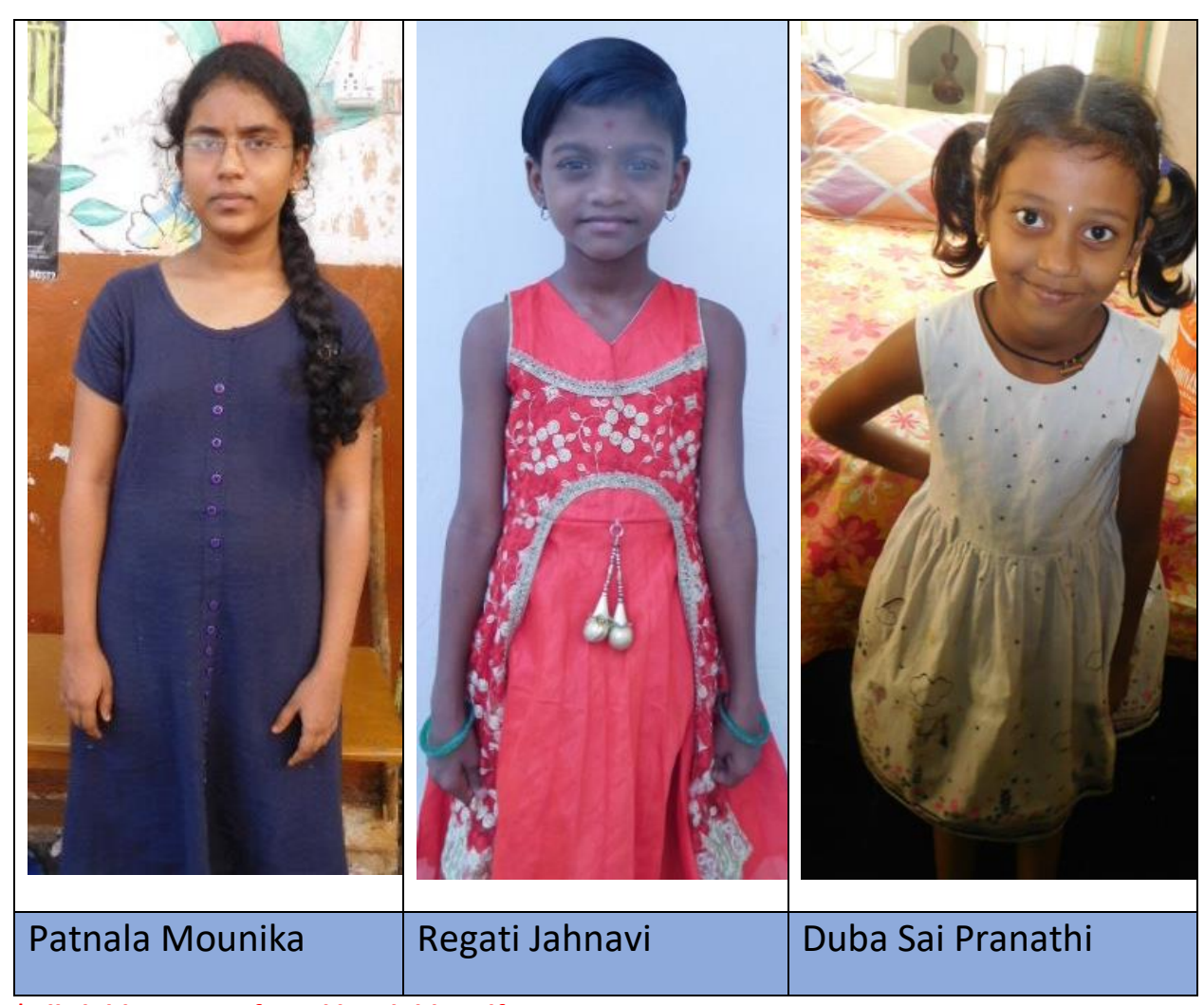
*All children are referred by Child Welfare Committee.

In these 6 months, 3 new children came to join in the home. Their case details are here under.