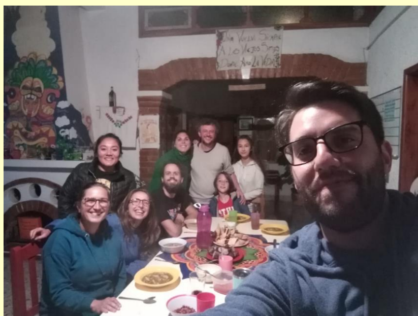
Junax San Cristóbal de las Casas, Chiapas, México.

We know there is hope and a lot of work to do in 2021!