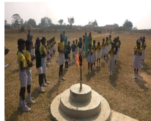
Annual Sports Day