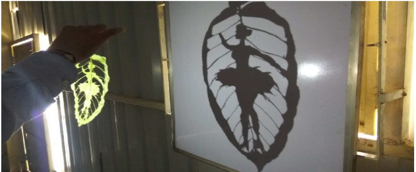
Art & Craft made by children using leaves, match sticks, used papers, etc