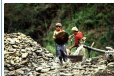
Poverty leading to child labor in Nepal

What we have learned from Covid-19 is that we are very much dependant on help from each other, and that by caring for one another we not only help the other person, but we are also helping ourselves.