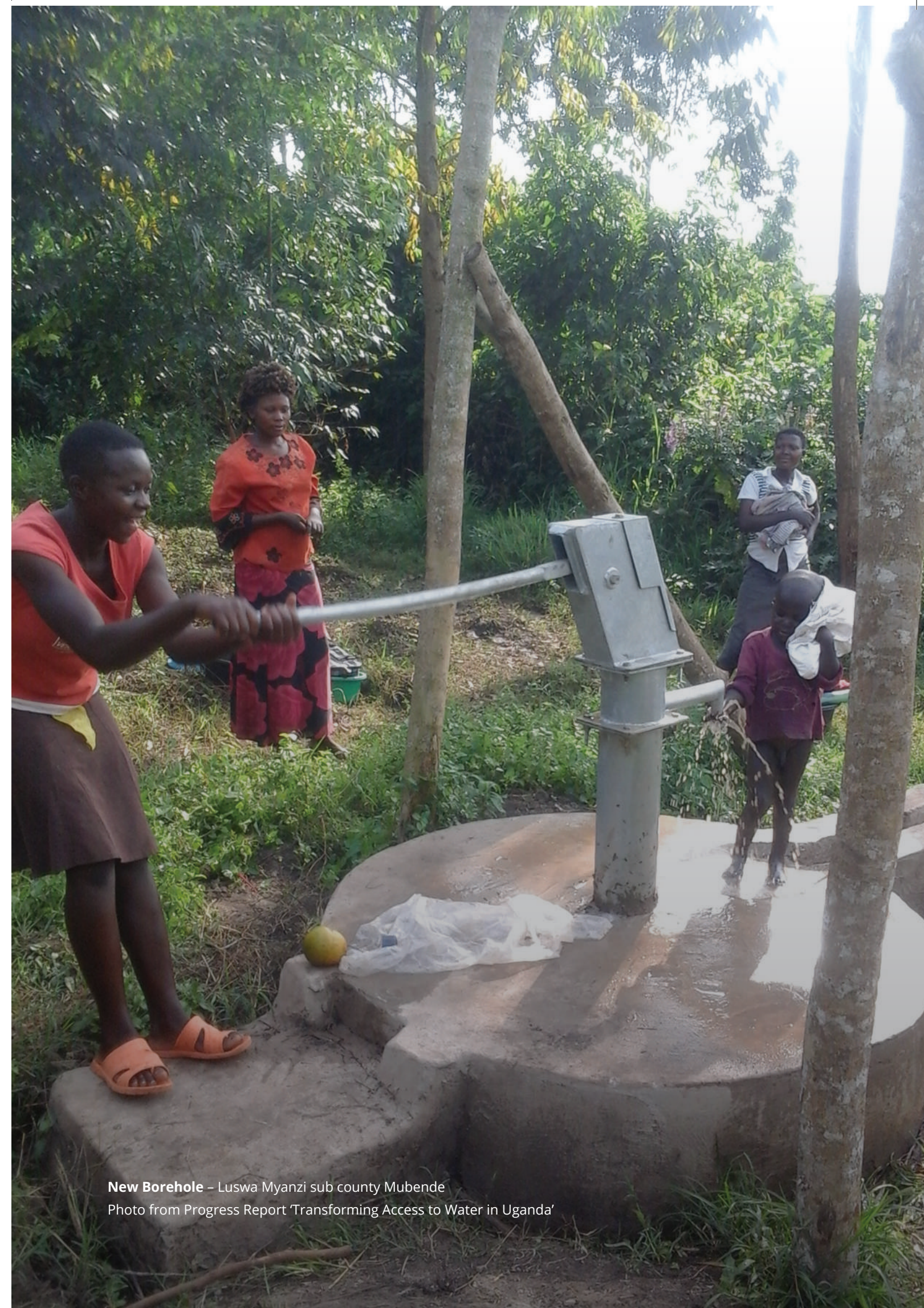
New Borehole – Luswa Myanzi sub county Mubende

* The partnership with PREFED in Rwanda ended in 2006