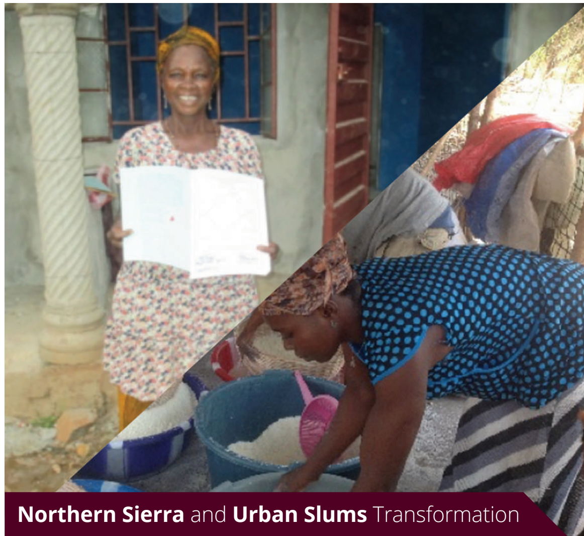
Northern Sierra and Urban Slums Transformation

With a grant from Comic Relief, Transform Africa and Association for Rural Development (ARD), its partner in Northern Sierra Leone enabled over 5,000 poor people in 3 districts in Northern Sierra Leone increase their opportunities for improved livelihoods. It provided them with affordable micro-credit loans, vocational and apprenticeship training, and improving their skills in numeracy, literacy, business and wealth creation.