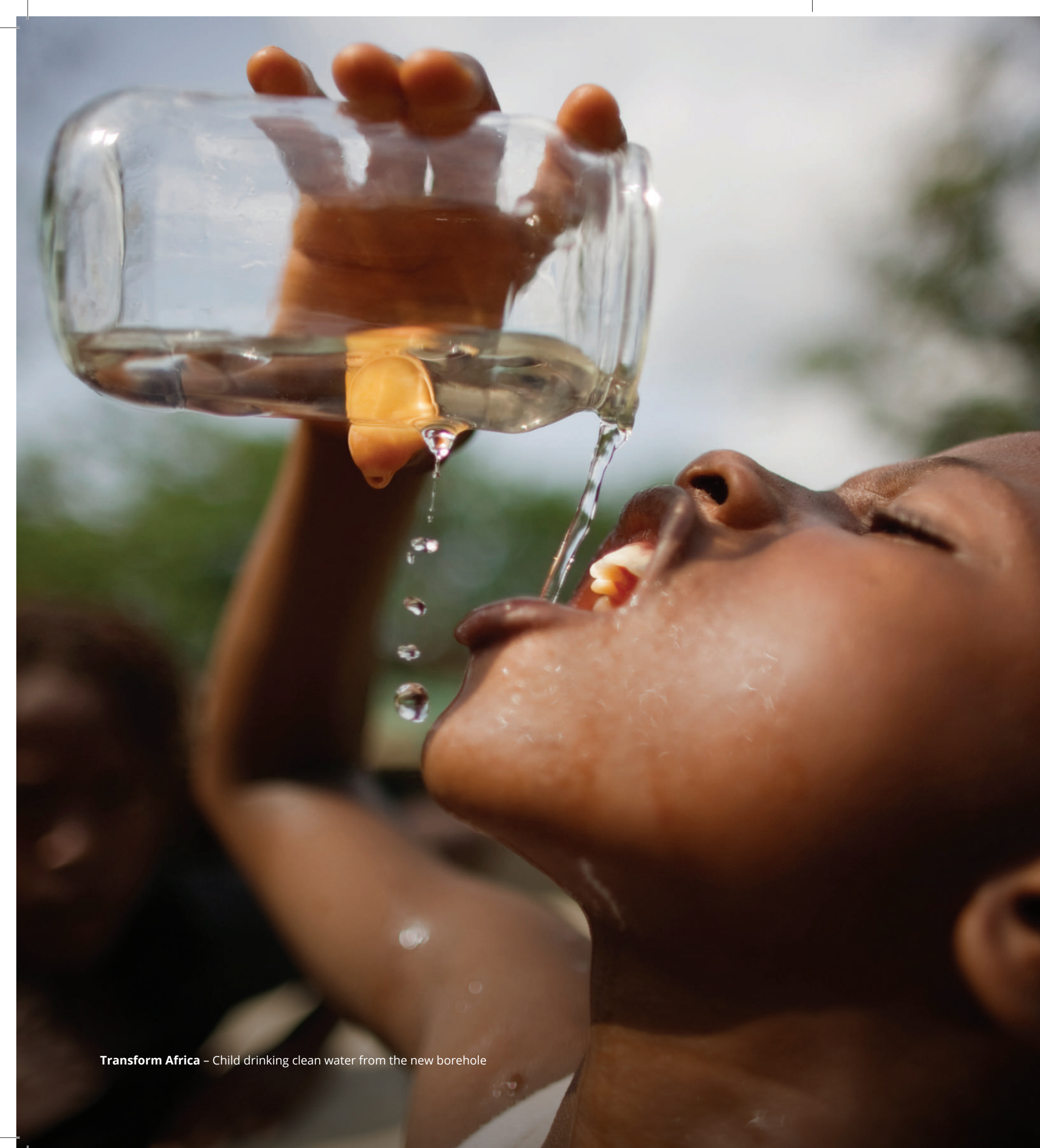
Transform Africa – Child drinking clean water from the new borehole