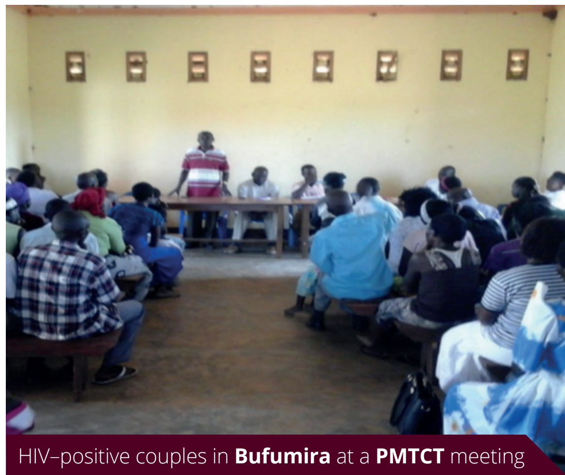
HIV-positive couples in Bufumira at a PMTCT meeting

With funding from The Chalker Foundation for Africa, Transform Africa in partnership with BIDA implemented a 12-month project in Bufumira Sub-County, Kalangala District, Uganda to contribute to on-going efforts to support mothers and pregnant women to eliminate the high incidence of mother-to-child HIV transmission prevailing in the area at the time. During the year, the number of positive mothers delivered by non-professional birth attendants was reduced from 134 the previous year to only 8. In addition, the number of HIV positive pregnant women and their partners who were on ARVs increased from 340 to 1,442.