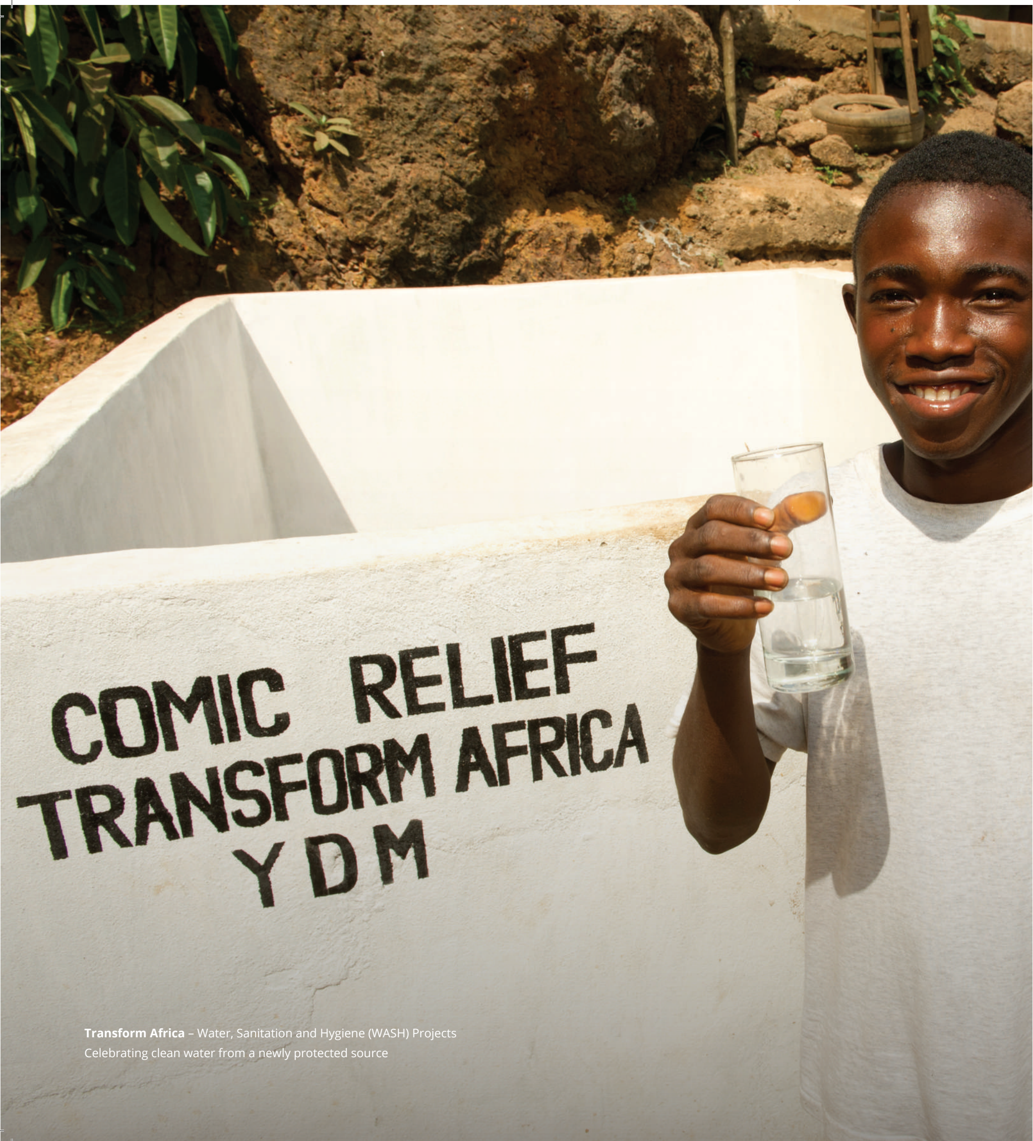
Transform Africa – Water, Sanitation and Hygiene (WASH) Projects Celebrating clean water from a newly protected source