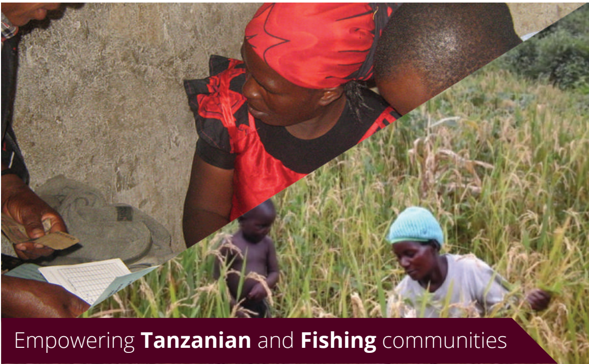
Empowering Tanzanian and Fishing communities

It supported over 4,500 community members in Iringa Municipality, Tanzania and Mpika District, Zambia by increasing HIV awareness, improving access to health services, and bringing about positive behavioural and attitudinal changes that would reduce the adverse impacts of HIV/AIDS. It also built organisations within the communities to take the lead in fighting HIV/AIDS, and provided affordable loans to women for small businesses, reducing their exposure to high risk sexual activity.