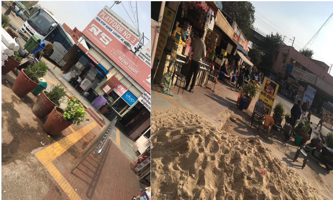
Pic 3: Reinstalled Handrails

We made a complaint to state disability commissioner and followed up rigorously. By continuously chasing the roadways authorities.