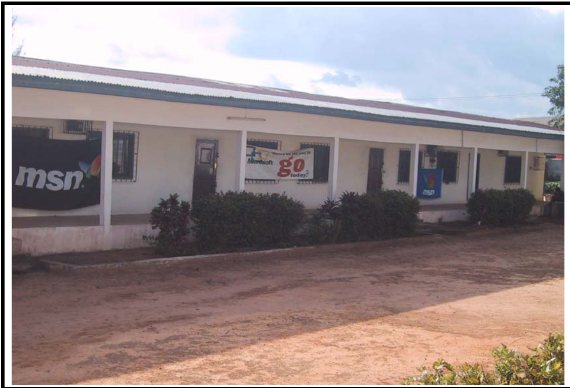
A cross-section of the Owerri Digital Village in 2008