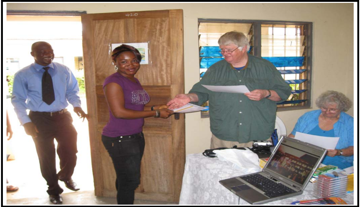
Former Peace Corps volunteers to Nigeria (now part of Friends of Nigeria, FON) participated in the graduation ceremony of some of our students.