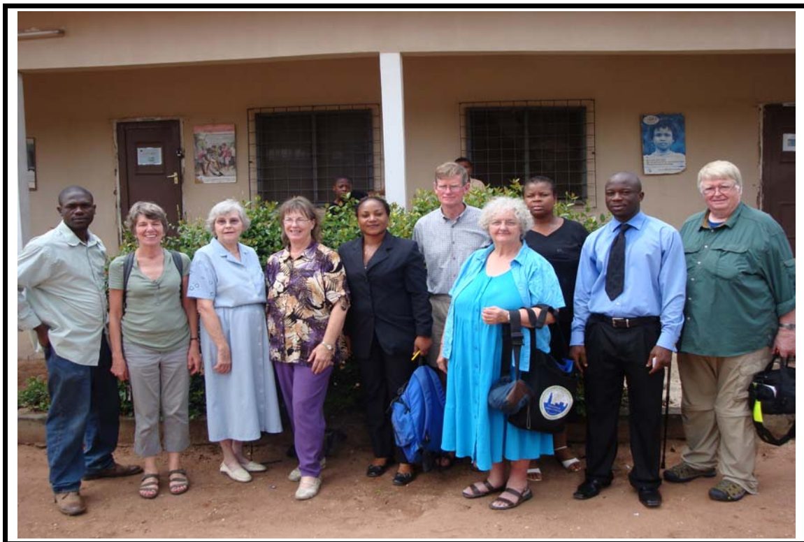
A U.S. delegation of Former Peace Corps Volunteers (Friends of Nigeria) visited the ODV in November 2008.