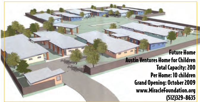
Plans for the Austin Ventures Childrens Home