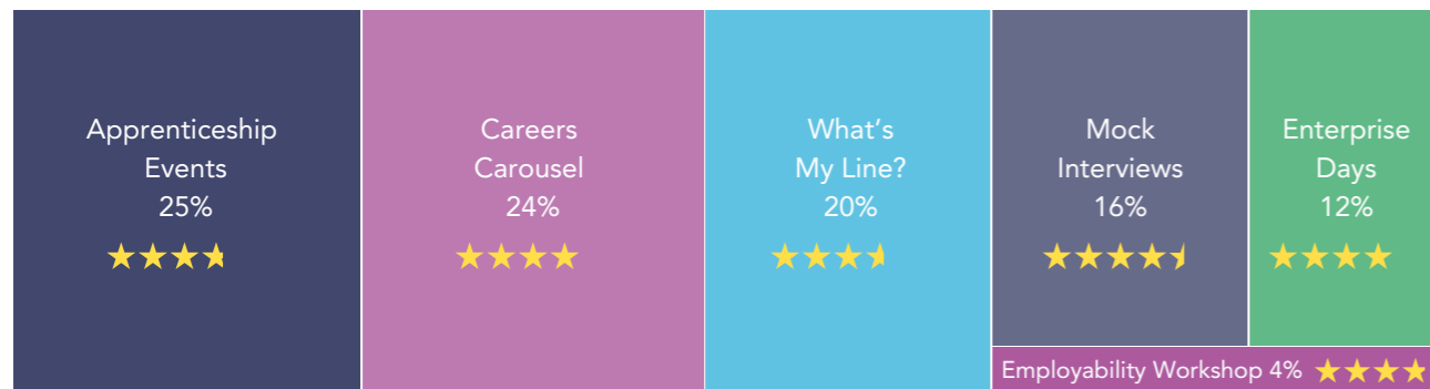
In-school activities by percentage number of student engagements, and student feedback score out of 5