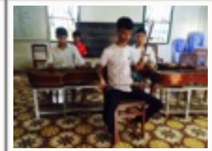
Some of our blind students practising Mohori music