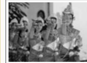
KCDI Students.

Cambodian culture and traditional arts is so special that today it is considered by UNESCO "World Intangible Cultural Heritage". Yet the Khmer Rouge under Pol Pot between 1975 - 79 killed so many artists they nearly managed to destroy everything. Our school is testimony to the courage and integrity of those artists who survived and their determination to re-build their country and their beautiful artistic heritage."