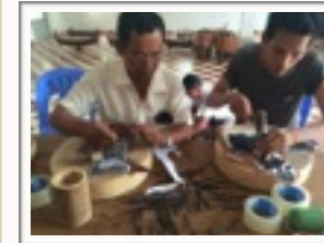
Making shadow puppets

ACLEDA Bank, 61 Preah Monivong Bvd; Phnom Penh