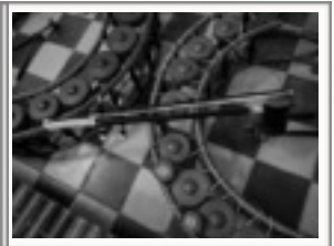
Our main hall at KCDI