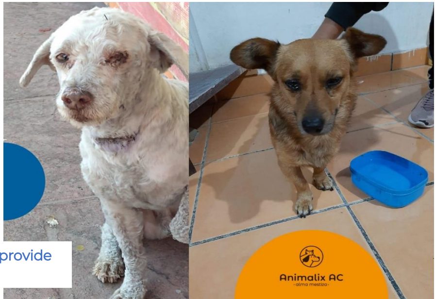
Sick dogs to whom we provide medical treatment