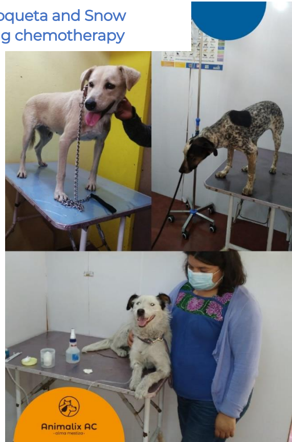
Kira, Croqueta and Snow receiving chemotherapy