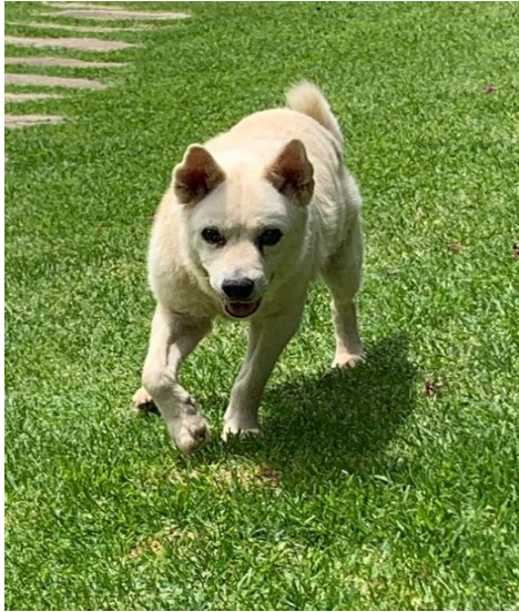
Magu is blind and deaf

Bones, Choco, Snow, Flea, Tito, Vaquita, Marshmallow, Samson, Cleo, Gordita, Gris (cat) have been adopted. We are waiting for a home Croqueta, Nikté, Nuez, Legs, Botxi, Dori and Elektra. Magú in an old dog that will no longer be put up for adoption, and Pepe is about to start his acupuncture treatment so that he can regain the ability to walk on his own and received his second chemotherapy to combat the TVT he suffers.