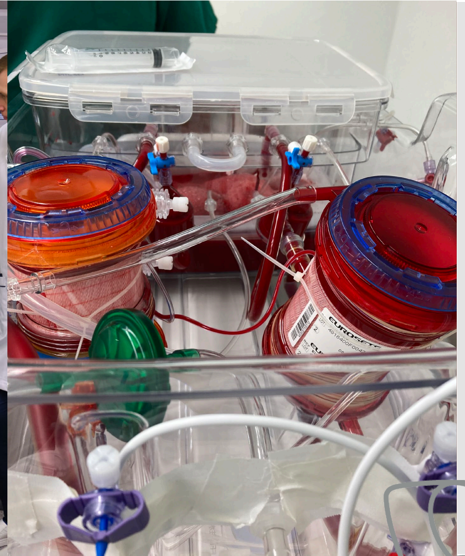
ORGAN PERFUSION MACHINES