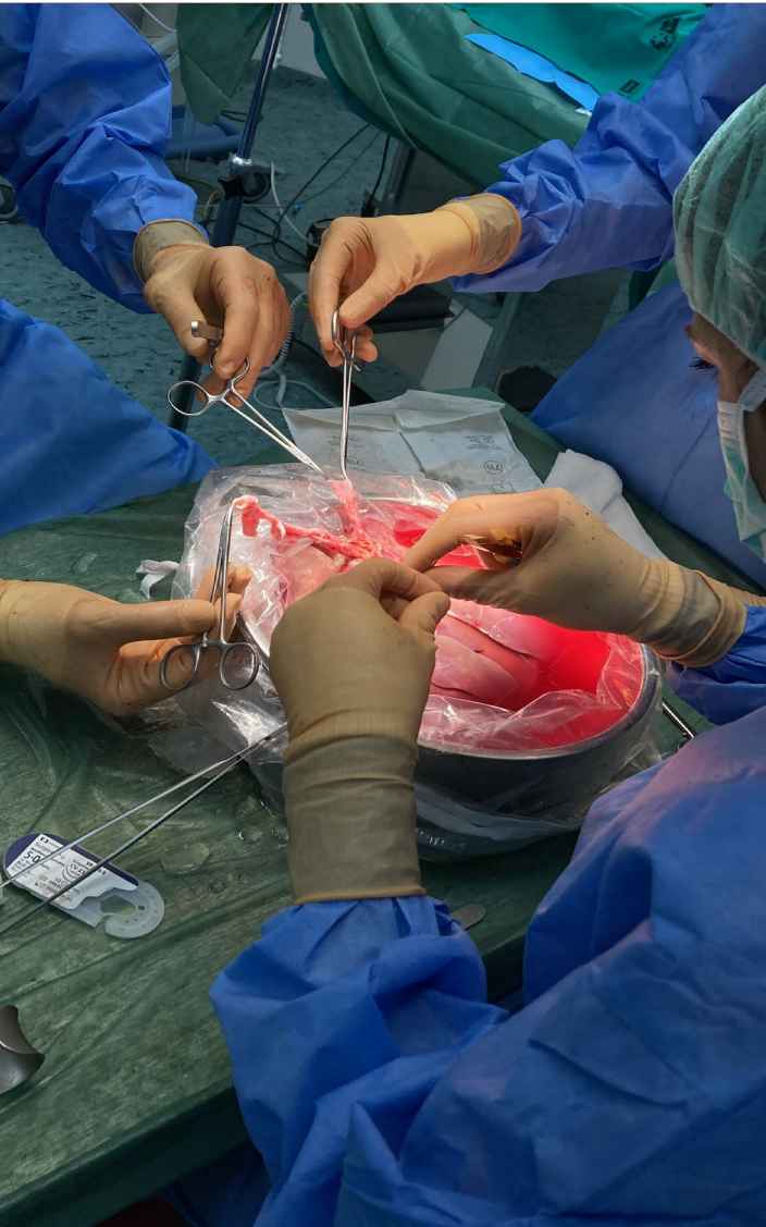
TISSUES AND CELLS FOR RESEARCH