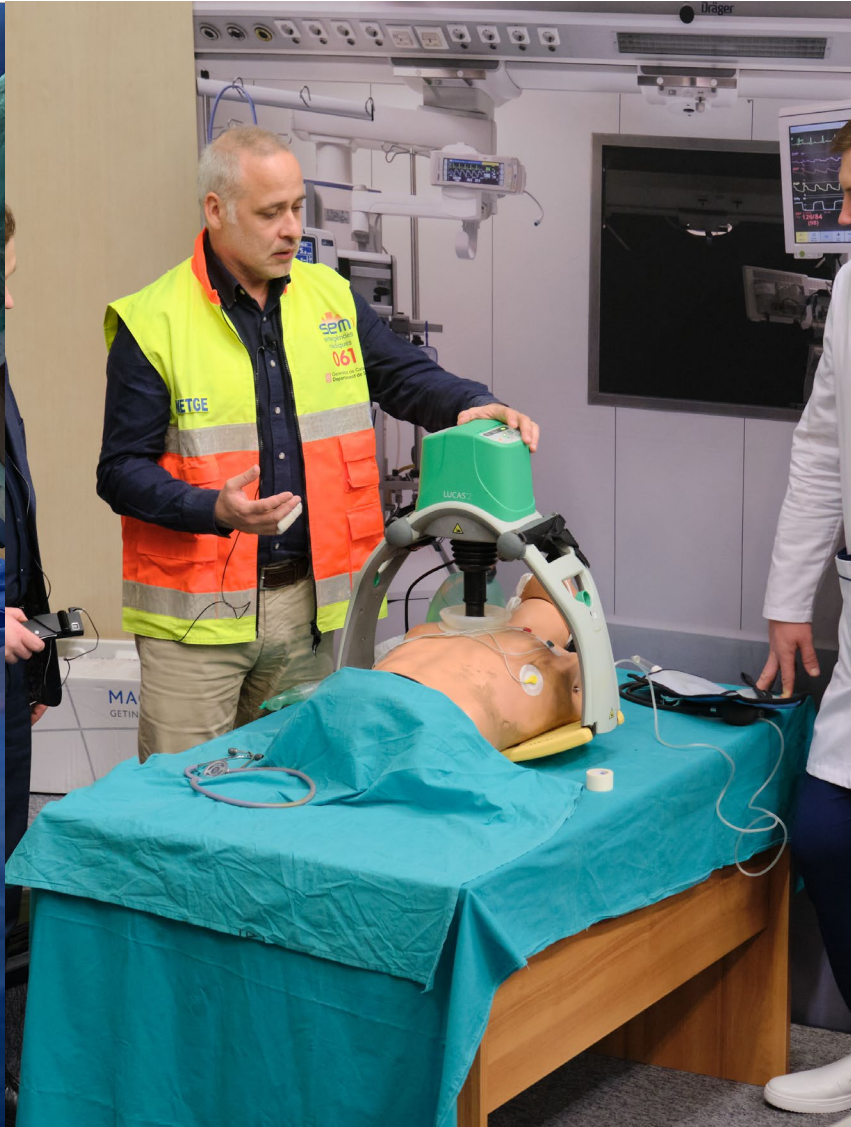
NEW ORGAN DONATION TECHNIQUES