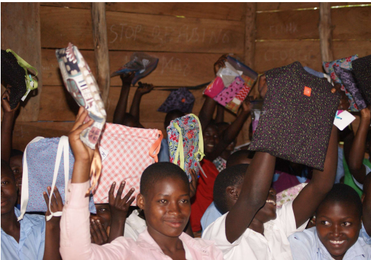
Days for Girls