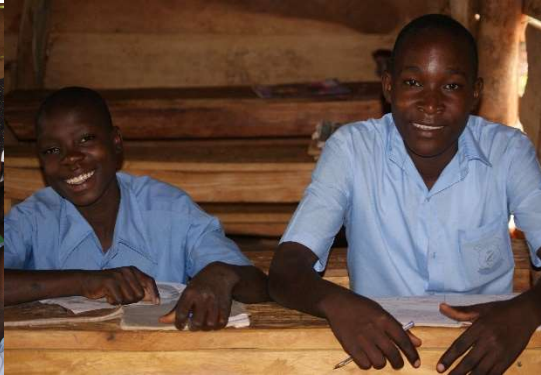
Students Funded by You - Our Donors