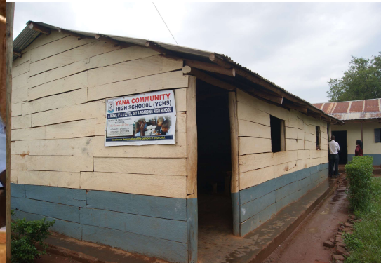
Yana CHS - A Work in Progress