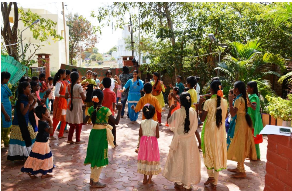
A grand finale after learning abhinaya, bhava and basic steps. The students, and their peer educators danced together