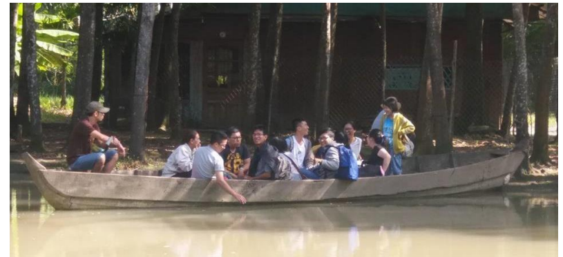
Teambuilding activities for the 2017-2018 cohort