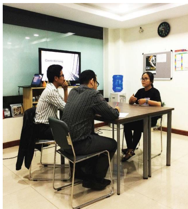
JAS project - Training sessions of job-searching skills for disadvantaged students in HCMC and Universities Village (round

113 grants provided to humanitarian and community development projects (addressing various issues in education, environment, inequality, disabilities, health care, etc.) benefited over 70,000 people in Southern Vietnam. Watch this video for Narrow The Gap introduction.