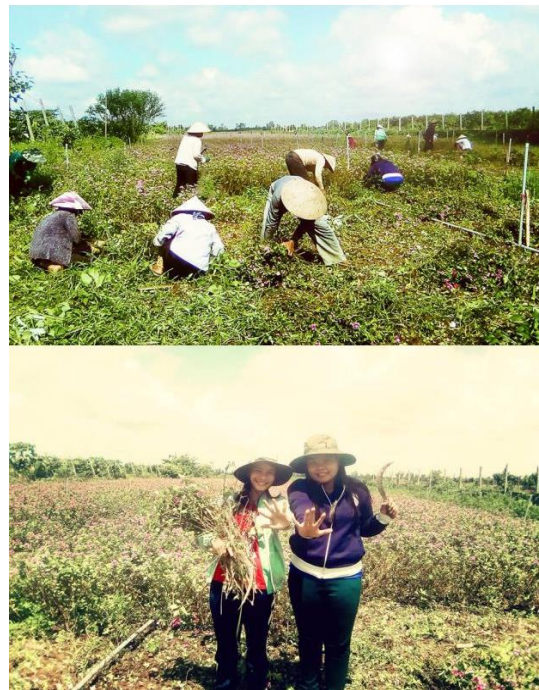
Growing herbal medicine garden in An Giang (round 3, 2016)