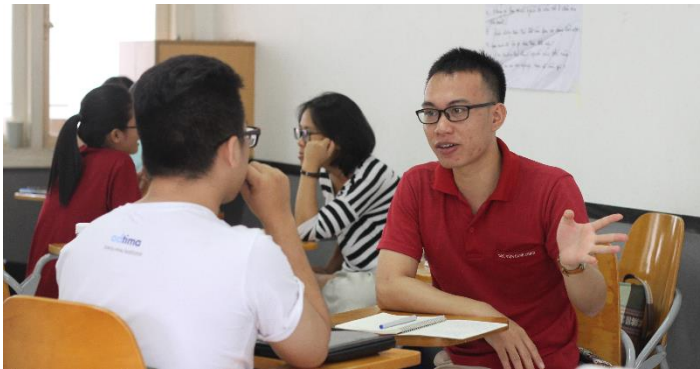
2017-2018 cohort in discussion