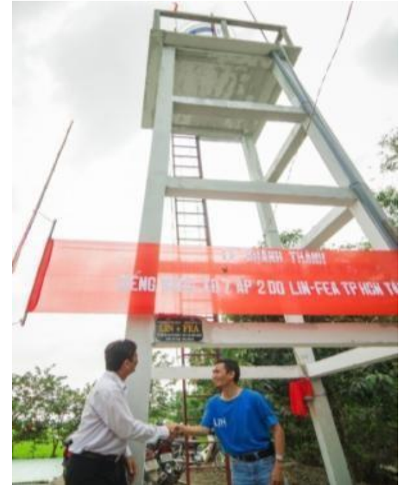
Clean Water Tower, one of the projects focused on Community Development (round 2, 2016)