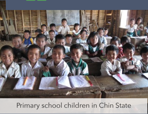
Primary school children in Chin State