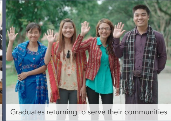
Graduates returning to serve their communities