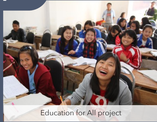
Education for All project