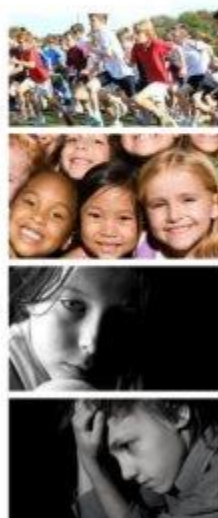
Stop the Silence Race flyer

BILLIE-JO GRANT 805.550.9132; bgrant@stopthesilence.org www.stopthesilence.org