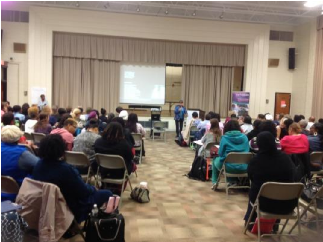
Training for Nurses