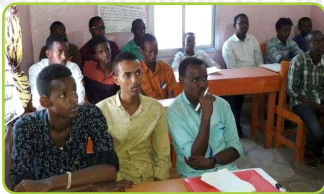
A class of youth in pursuing informal education in Eastleigh.