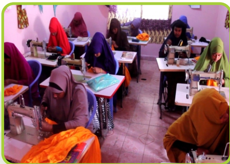
Taking a tailoring and embroidery course held at our center.