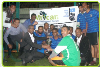
Sports activities for peace building and conflict resolution held on 22 September 2014.

Peace building and conflict resolution will guarantee the constitution of Kenya to safe guard all the rights of the people for example, the freedom of thought, conscience, expression, movement, association, assembly, non discrimination and the rights to food, shelter, education, work, as anchored in the constitution.