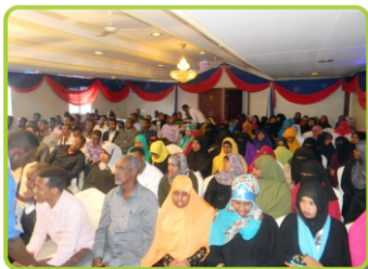
Conference organized by AYDF to equip the youth in Eastleigh with mediation and negotiation skills.

Peace building and conflict resolution will guarantee the constitution of Kenya to safe guard all the rights of the people for example, the freedom of thought, conscience, expression, movement, association, assembly, non discrimination and the rights to food, shelter, education, work, as anchored in the constitution.