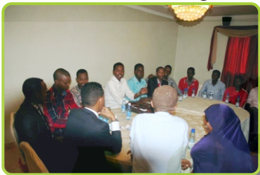
Peace building workshop for inter-party youth campaigners in Eastleigh, organized by AYDF.

We will therefore, strive to put mechanisms in place for local good governance and political stability. This approach will enhance peace and conflict resolutions in the area of our operation. In this regard, we will organize seminars, symposia and peace conferences/workshops in violence torn areas of the Eastleigh.