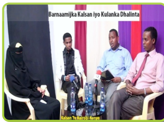
The role of youth in addressing Conflict resolution in Eastleigh during the general election 2017 through the electronic and mass media.