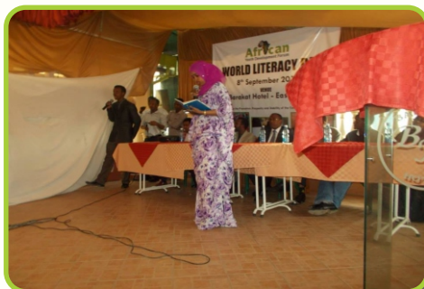
This world literacy day AYDF has mobilized the youth in Eastleigh to create more awareness on the importance of education in the society.