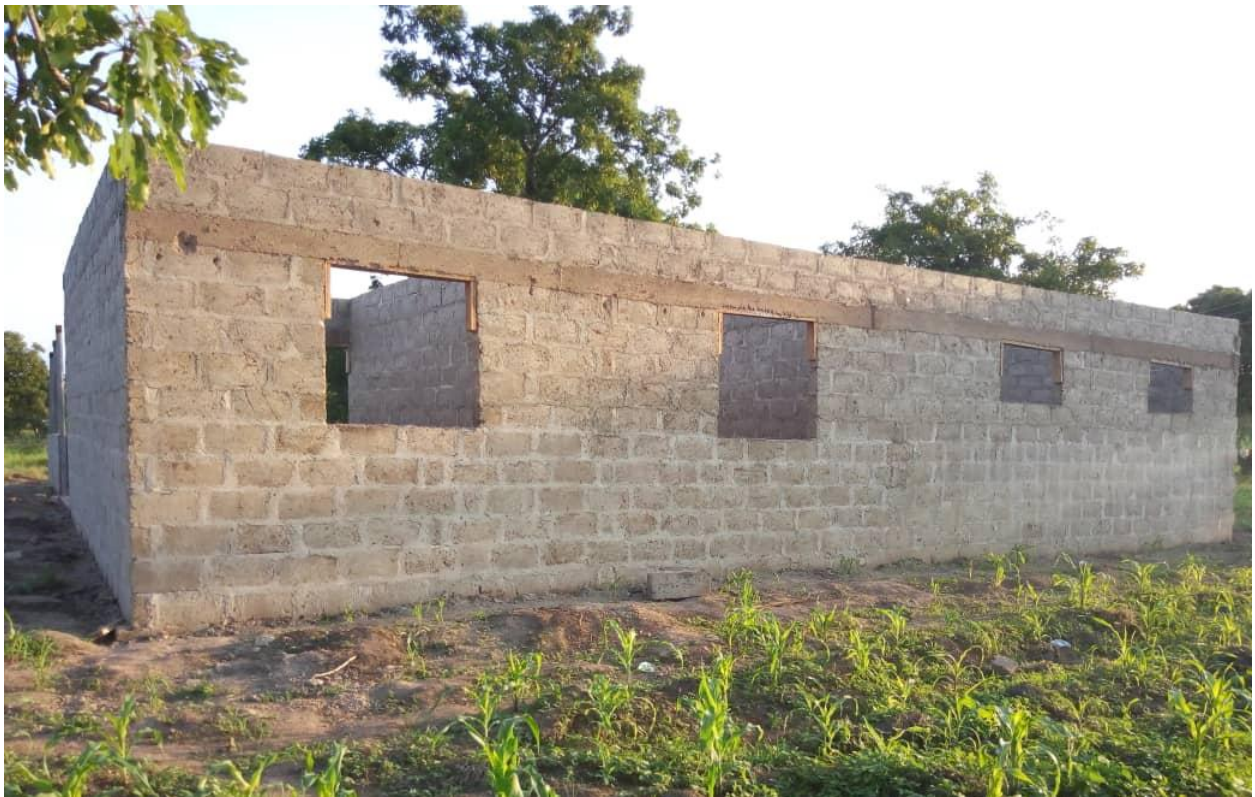
Back of the main structure to for machine room, cooling room for butter and store room for finished products.