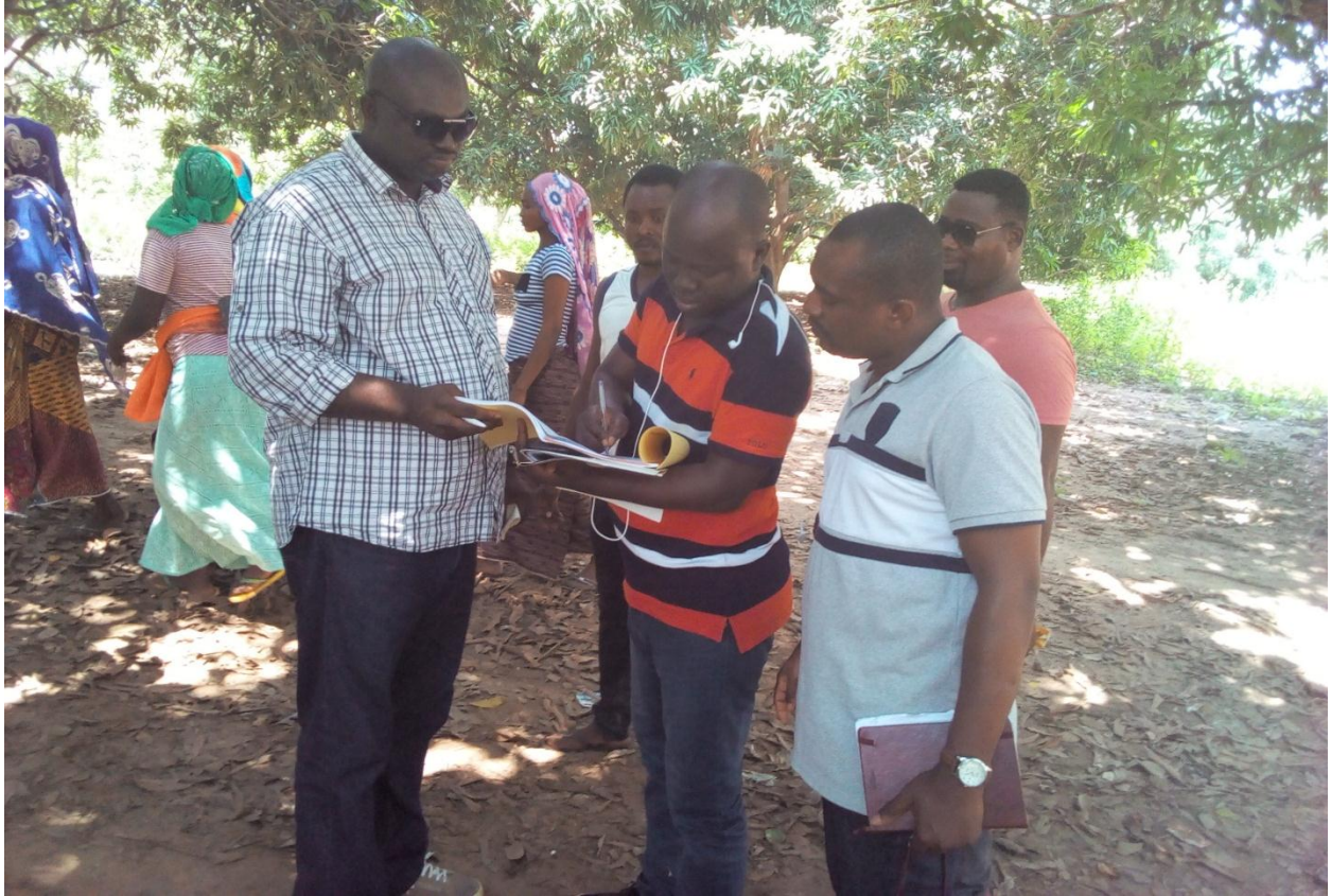
Combined Monitoring team from UNDP and Ministry of Environment, Science, Technology and Innovations Completing the visitors log book after a visit to the Ntereso project site afterz interacting with the community.