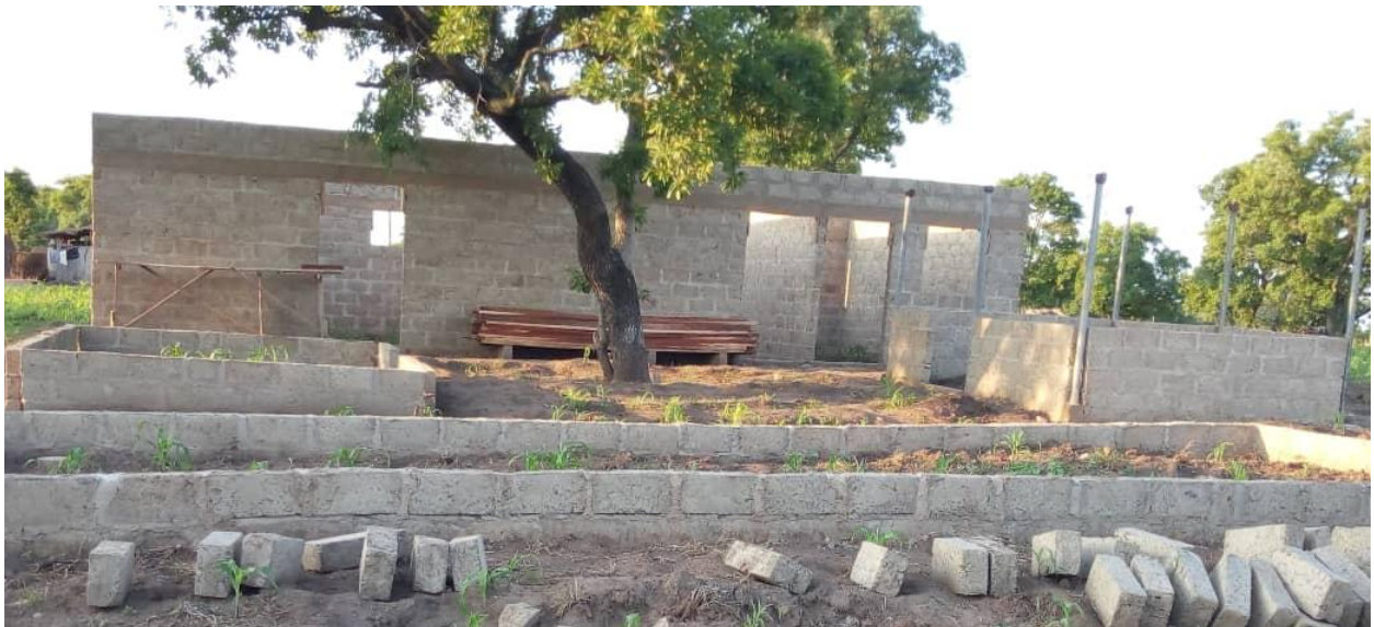
Constructed Structures ready for roofing at the project community at Chache