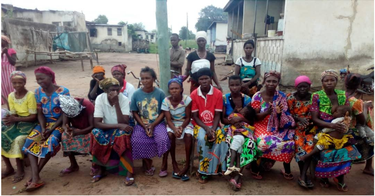
Some of the project beneficiaries at a meeting at Chache