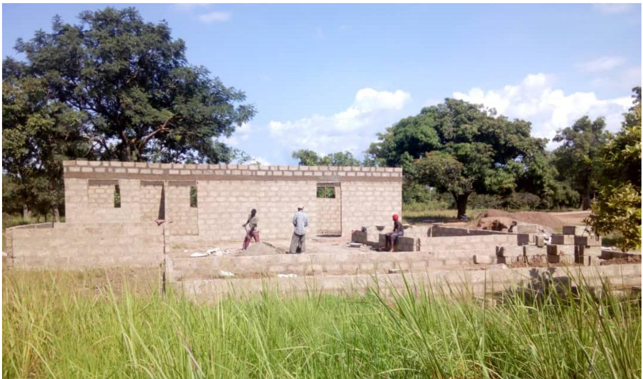
The structures under construction at Ntereso community Ready for Roofing