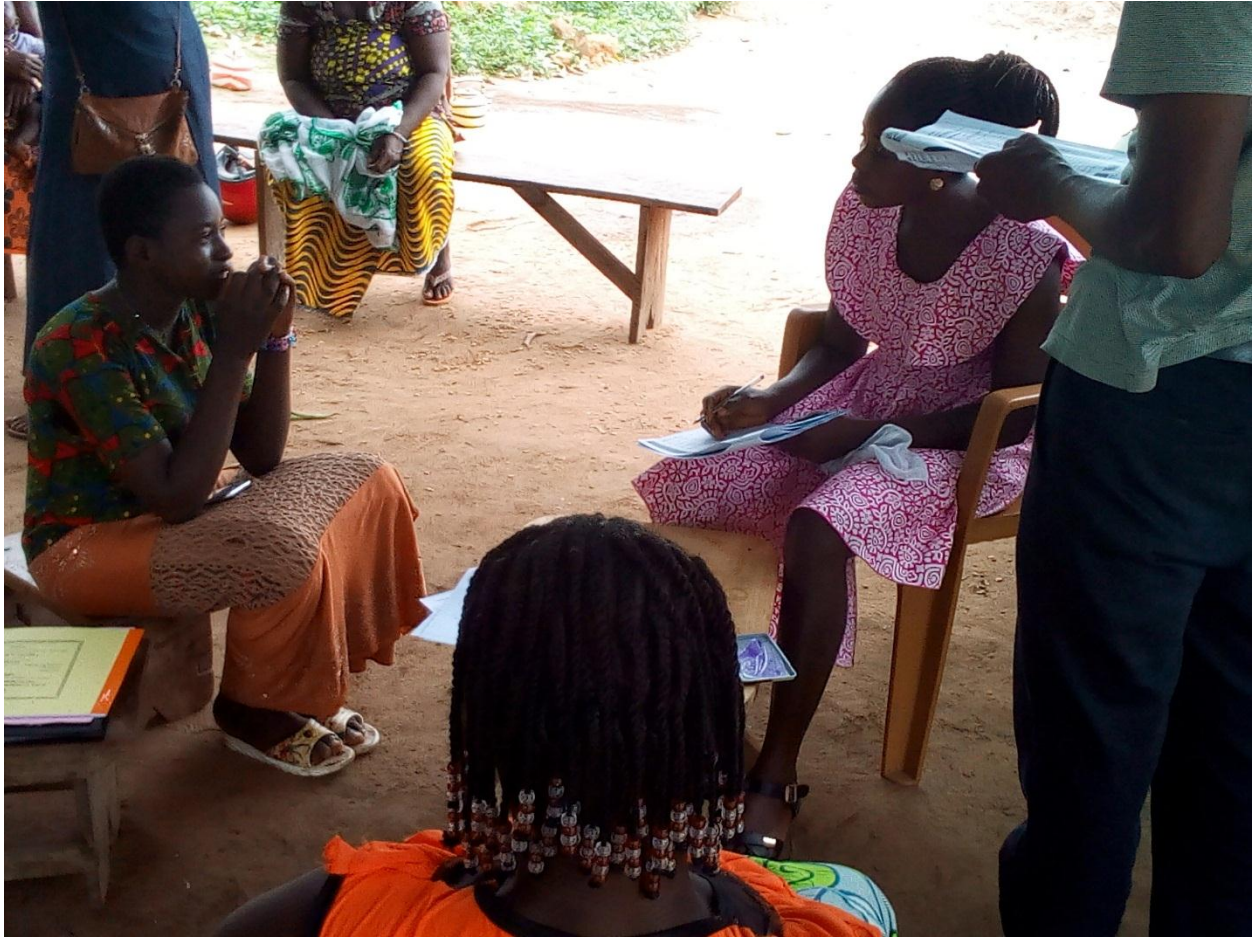
A young lady from the community registering to benefit from the project at Ntereso