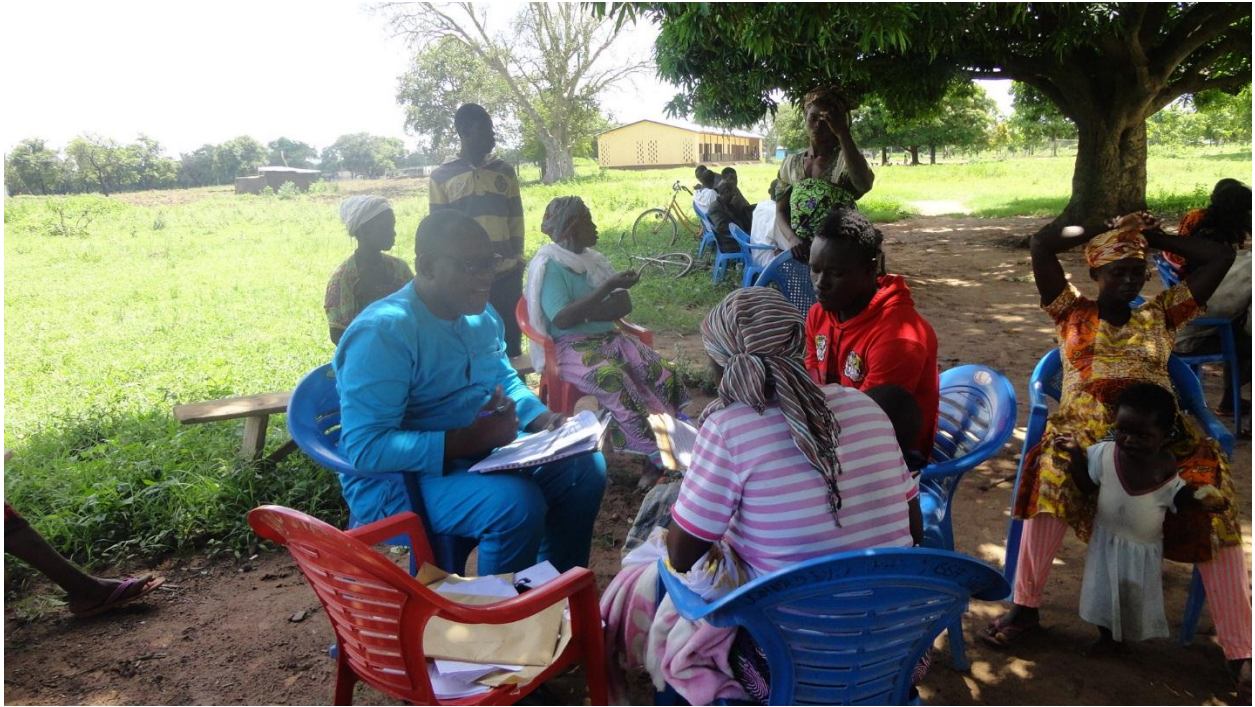
CEO of the Foundation interviewing a registered beneficiary as part of the baseline data collection process of the project.