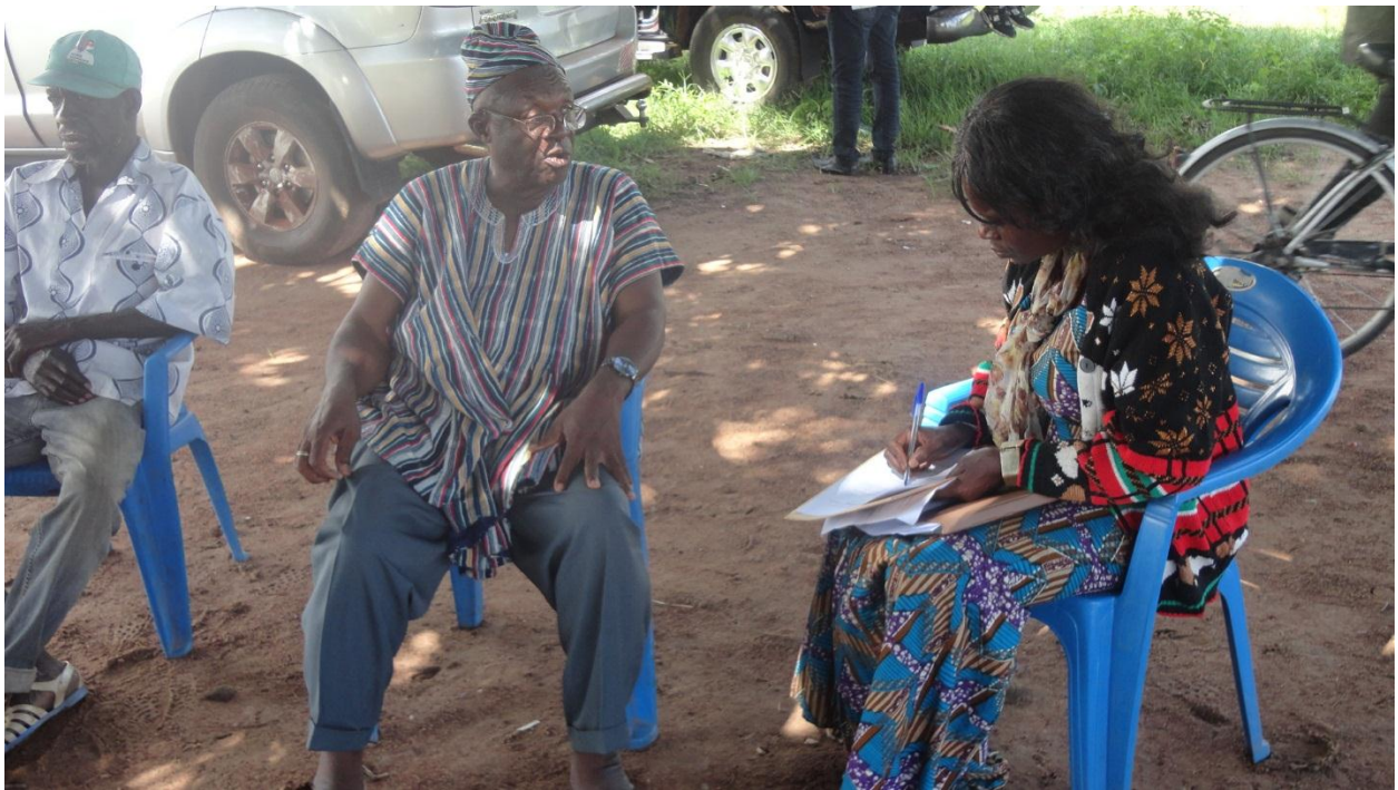
Director of Programmes of the Foundation interviewing the Chief of Chache as part of the Gender Analysis Study of the Project.