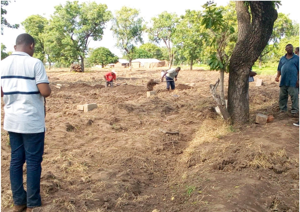
Monitoring and Evaluation officer of the Project Management Team of Ministry of science inspecting Progress of work at Chache