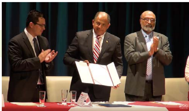
President of Costa Rica (2014-2018), Luis Guillermo Solís Rivera