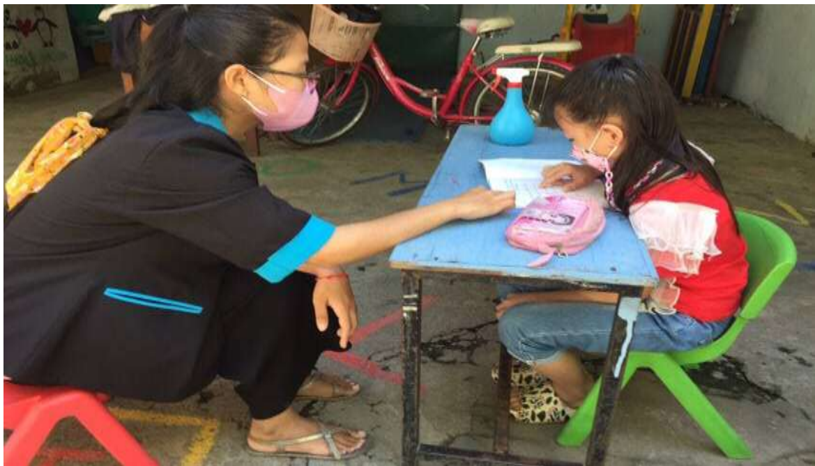
SCC-CBE students came to get the lesson from the teacher on August 2021 in the context of Covid-19