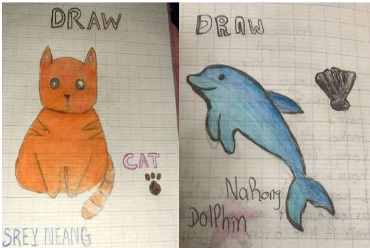
SCC-CBE Students learn to draw picture during self- learning at home on September 2021