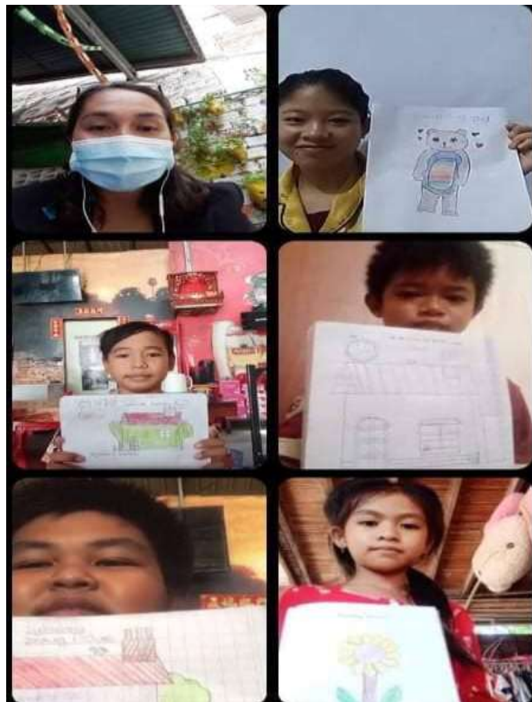
SCC-CBE students drew picture at home on September 2021