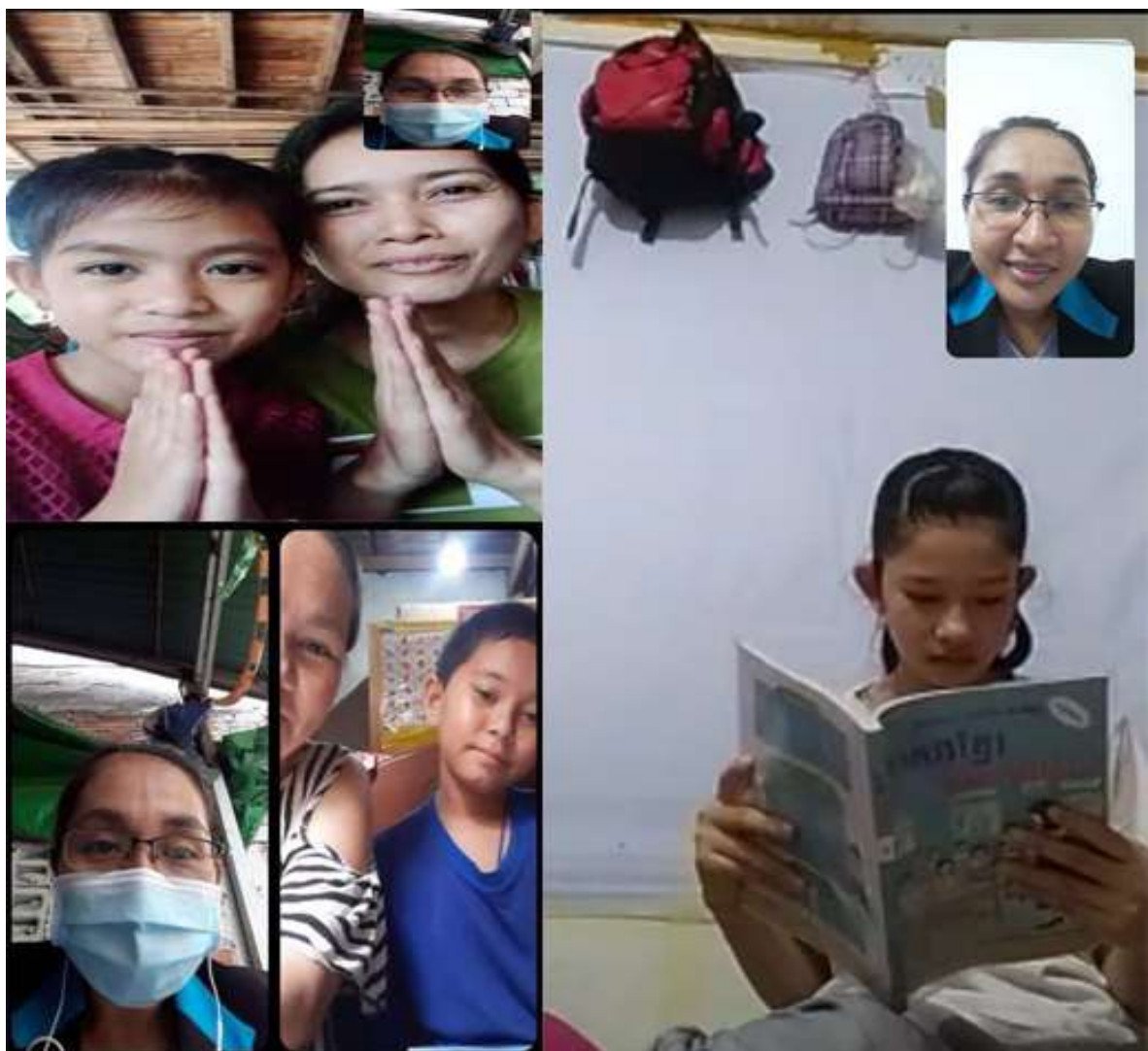
SCC-CBE Students study their subject via online in the situation of Covid-19 spread up on August 2021