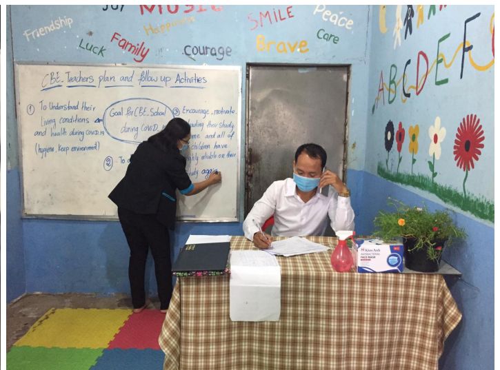
SCC-CBE teachers teaching children via online during Covid-19 and made list for following up parent of children

Students were not allowed to attend the school for a while: Despite facing a bad crisis situation and students could not attend the schools; however SCC-CBE teachers have not given up their duties. They have been working with parent/caregivers through social media such as making phone calls, Messenger, or Telegram on three main tasks as follows: