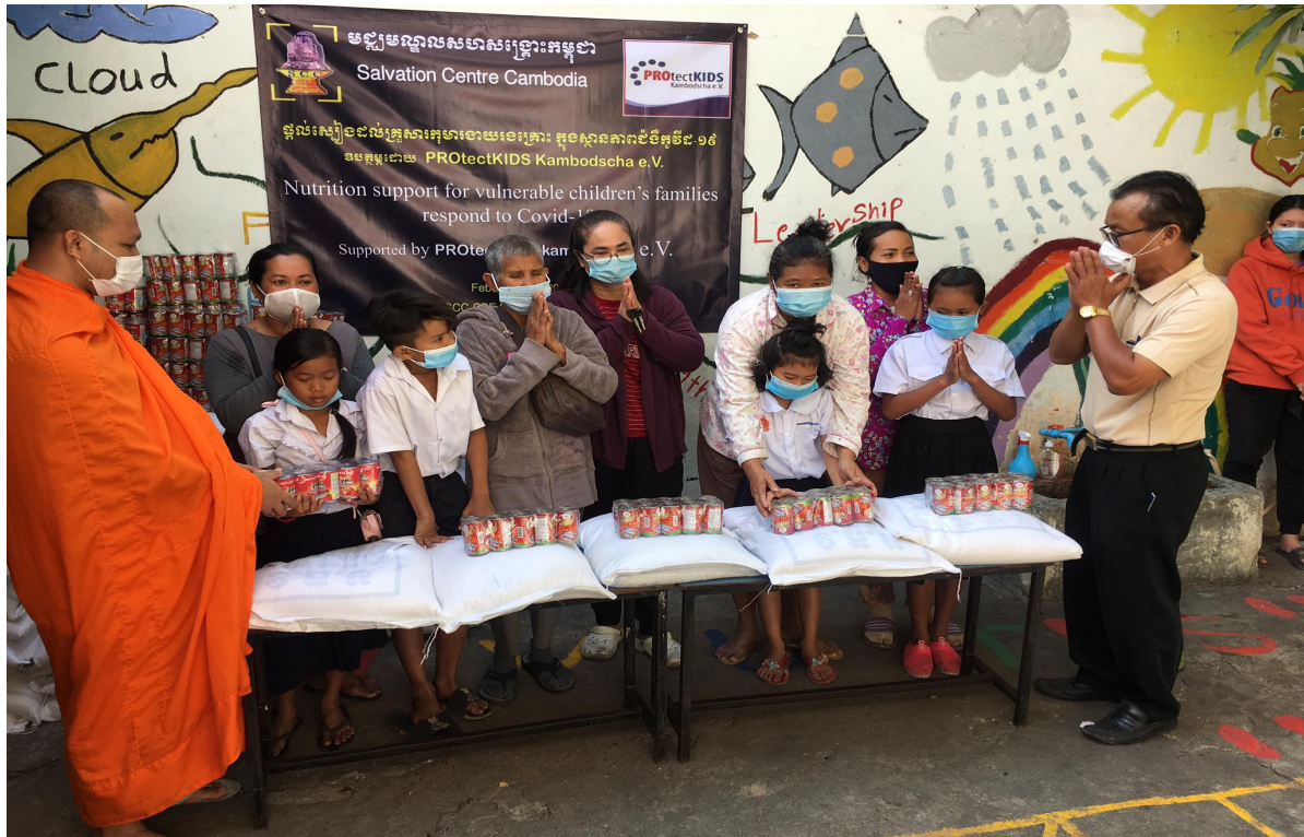
Donated rice to vulnerable children since February and March 2021

Reduced hunger by providing nutritional support during COVID-19 pandemic: SCC-CBE School provided nutritional support such as 15 kilograms of rice and 10 canned fish to the 56 poorest of