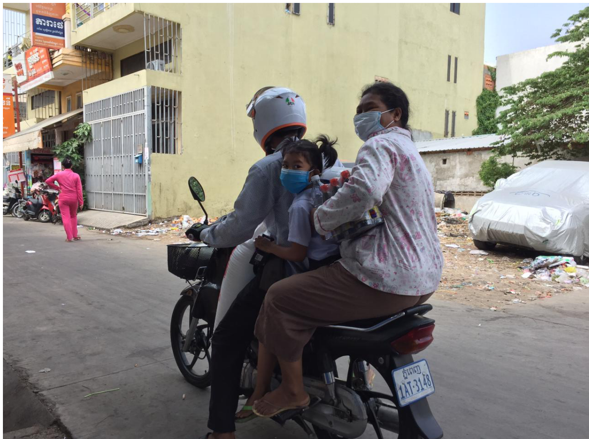
Poor family children's received welfares support during Covid-19 from SCC Project