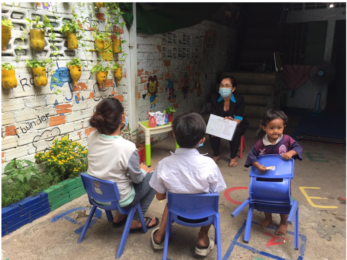
Poor family member received counseling during Covid-19 from SCC-CBE teacher