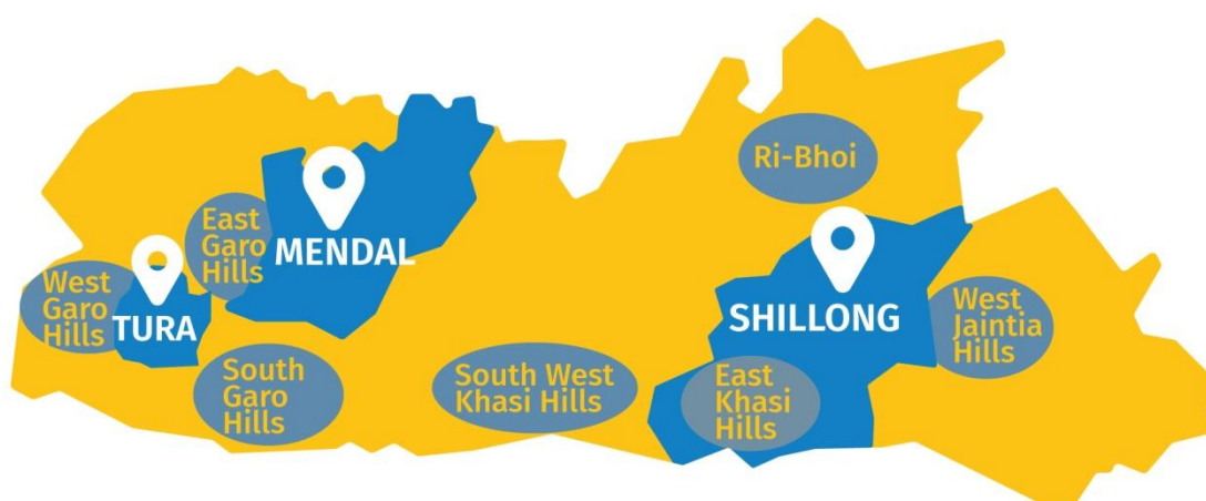
Bethany Society in Meghalaya, India

The major focus of our efforts is in Meghalaya and we work in partnership with other organizations across Northeast India