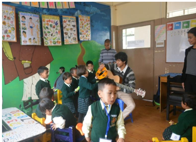
Early Education Unit

HO: Arai Mile, New Tura, West Garo Hills, Meghalaya - 794101 Ph: 91-3651-232396