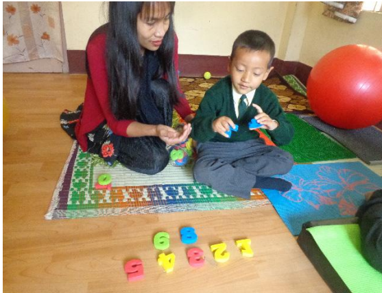
Early Intervention Service