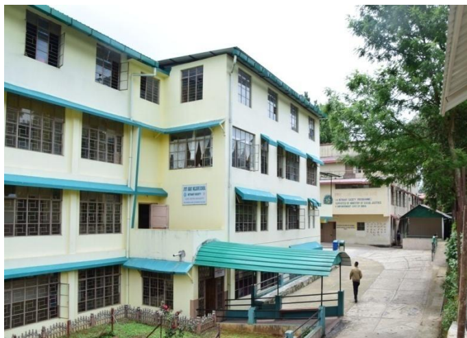
Jyoti Sroat School Campus

Video: Watch more about Jyoti Sroat School here