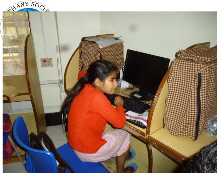
Computer Centre for the Visually Impaired