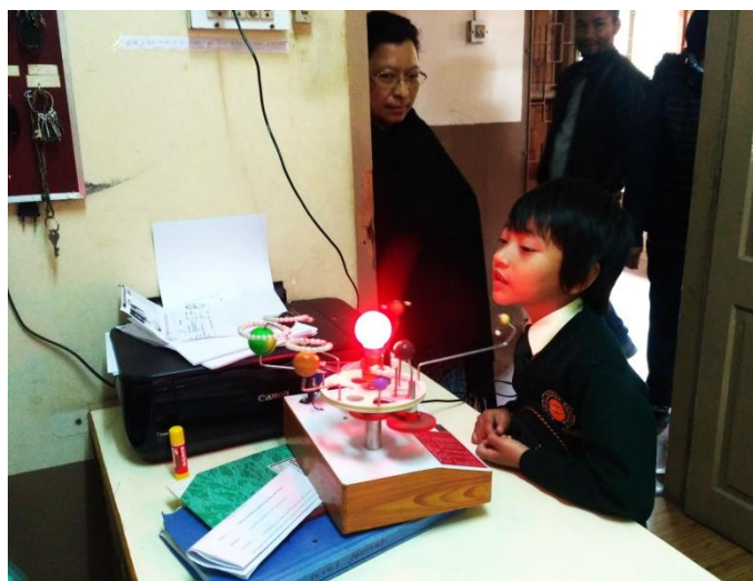
Multi-Sensory Learning through Innovative Teaching-Learning Materials