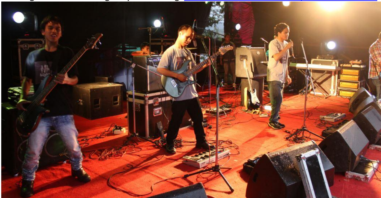
Light After Dark performing at the La Tomatina festival held in Shillong, May 2016