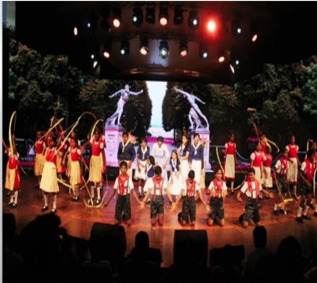
ASEEMA in Sound Of Music