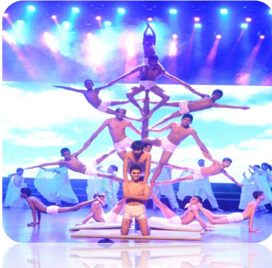
Victoria Memorial School for the Blind in MAHATMA.

Under this program the children go through extensive rehearsals and are trained by the best in the business of creative expertise, be it singing, dancing or acting and are given an equal opportunity to perform. This strengthens their talent providing tremendous exposure and boosts their overall personality and confidence .