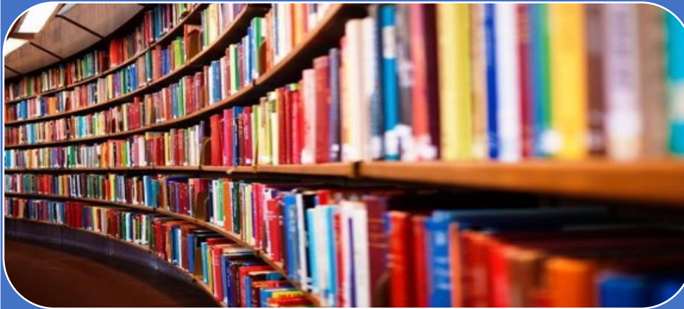
125+ New Libraries initiated in Indian Schools, 3 in Nepal