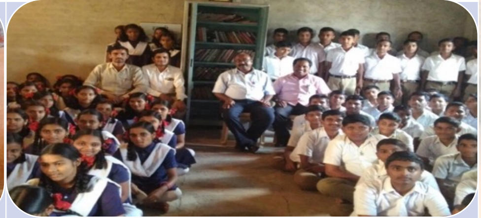
40+ New Schools in progress (2019)