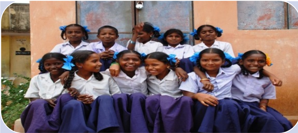
25,800+ Children positively benefited