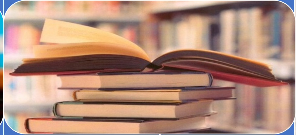
39,750+ Books sponsored