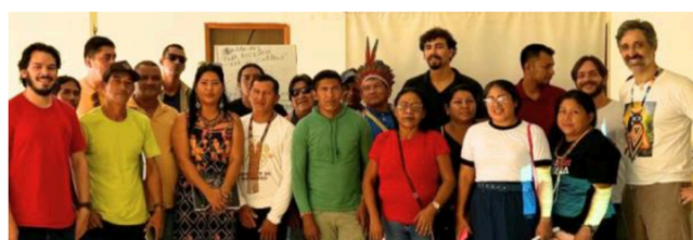
Our team meeting with key members of the Guajajara Community in July 2024