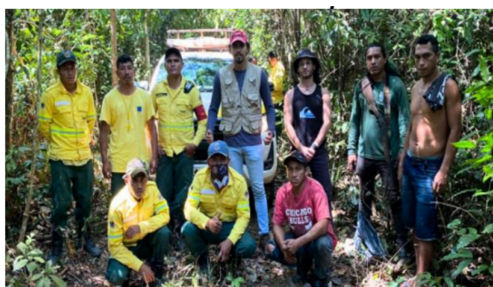
Volunteers from Forest Guardians – the Community's Protection Team