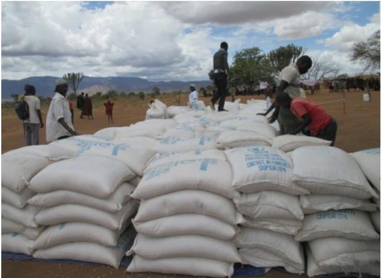
Fig 6: Food items received from WFP for distribution in Kaabong

We are also currently implementing a human wild life mitigation project under UNDP and NEMA in Lolelia and Kapedo in Kaabong, to promote wildlife conservation as a community benefit and appreciate co-existence between communities in Kapedo, Lolelia and wildlife to create bio diversity and livelihood growth.