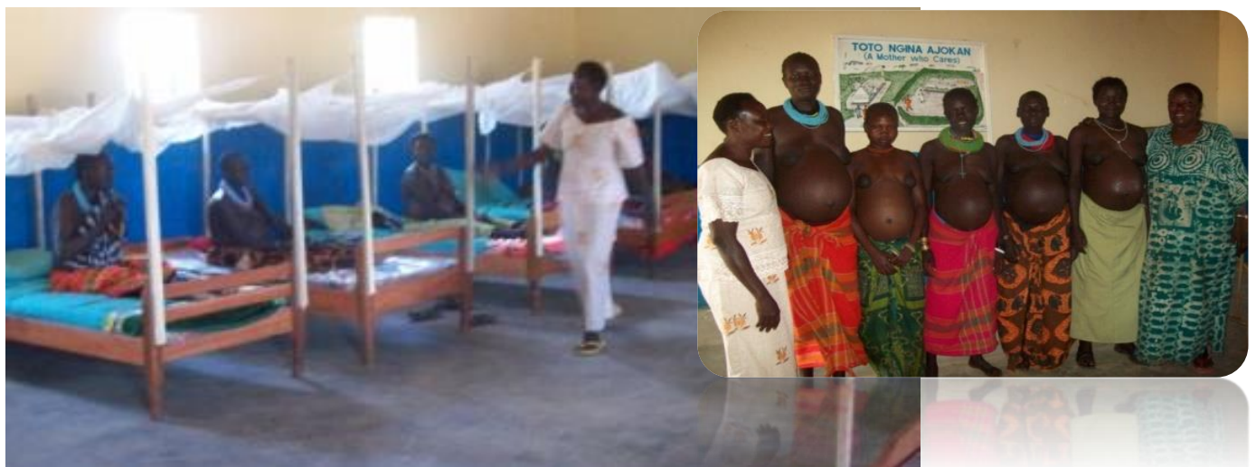
Fig 8: AWARE UGANDA Maternity waiting house in Kaabong AWARE Centre