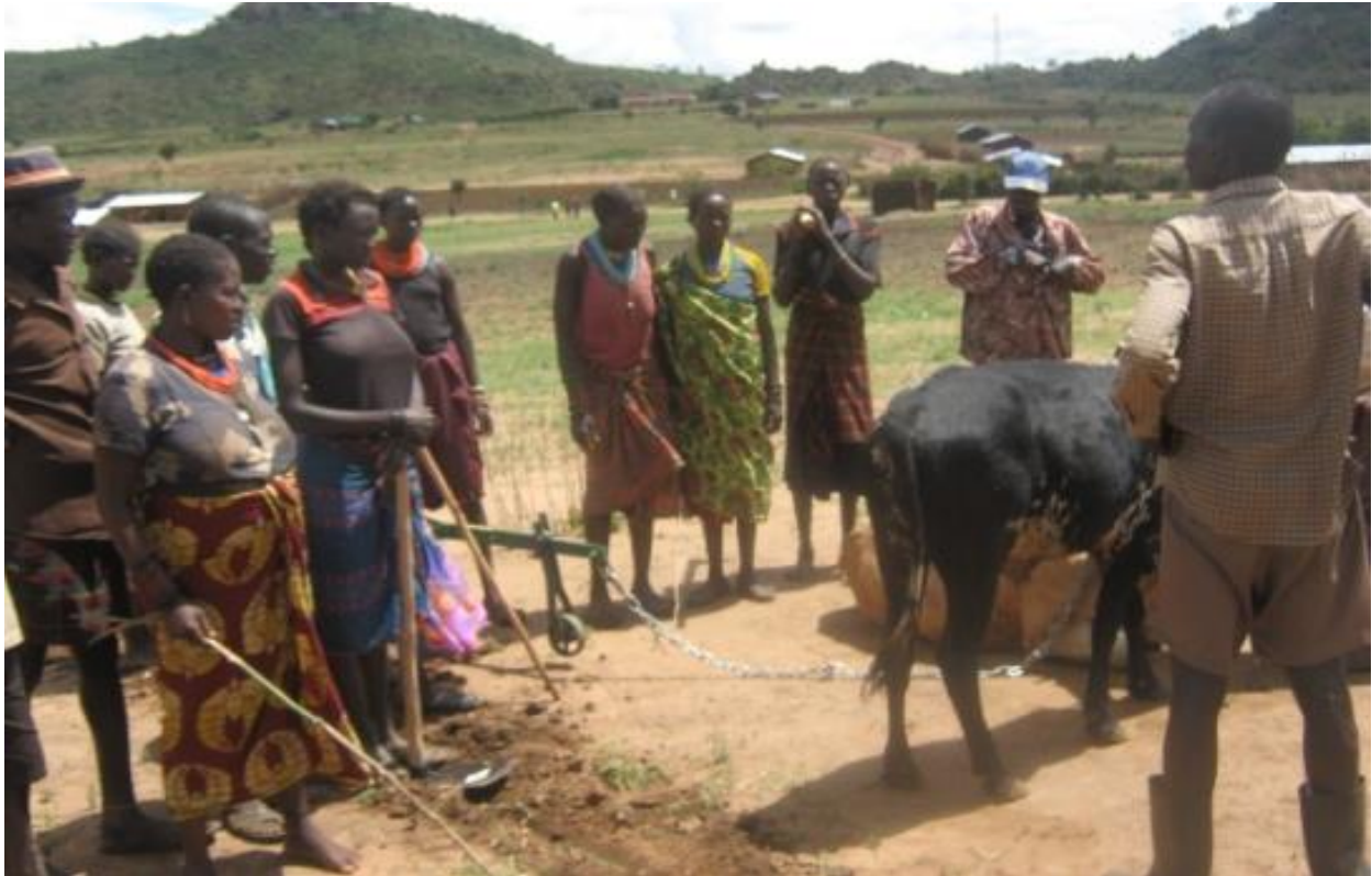
Fig 9: AWARE UG Members learning ox-ploughing skills.