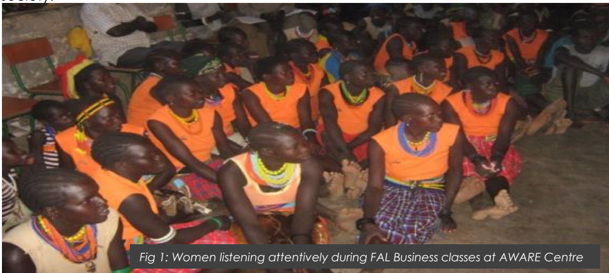
Fig 1: Women listening attentively during FAL Business classes at AWARE Centre

We had a regional annual meeting and NAADS meeting, this was to ensure that the organizations activities are coordinated to that of the District for a better impact on the society.