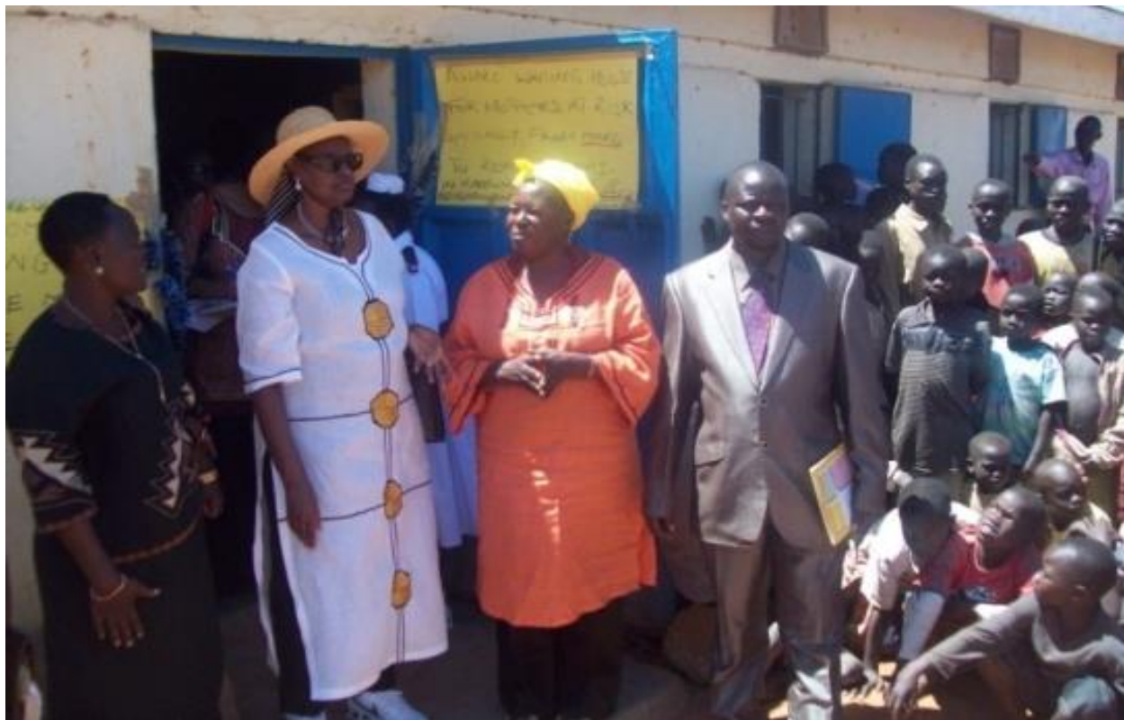
Fig 5: Uganda's first lady Janet Museveni visiting AWARE maternity waiting centre in Kaabong

AWARE has established a safe GBV house at AWARE centre to help treat victims of GBV through counseling, post trauma treatment, providing safety and meals before relocating them to safety to their nearby relatives.