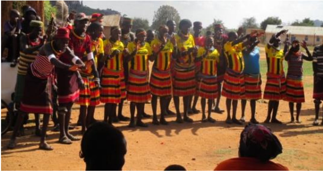
Fig 3: AWARE Cultural group entertaining guest at a meeting