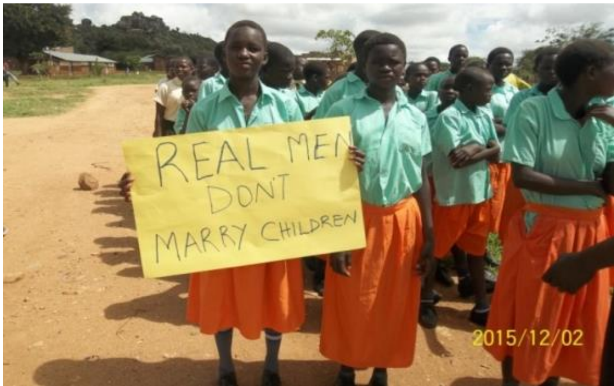
Fig 4: girls rescued from GBV, sexual violence and Early child marriages

AWARE has conducted awareness creation, capacity building and GBV/DV ACT to 20 police, 15 health workers, 20 elders, 10 district councilors in Kaabong district to sensitize them about all forms of discrimination against women and Human rights, EGBV,EVAW, DV ACT, case handling, reporting procedures, this has been conducted with the guidance of community legal facilitators in Kalapata, kapedo and Kaabong town council, as a way of promoting duty bearers active participation in creating awareness on EVAW,EGBV, ESGBV, to promote women rights and community empowerment and development