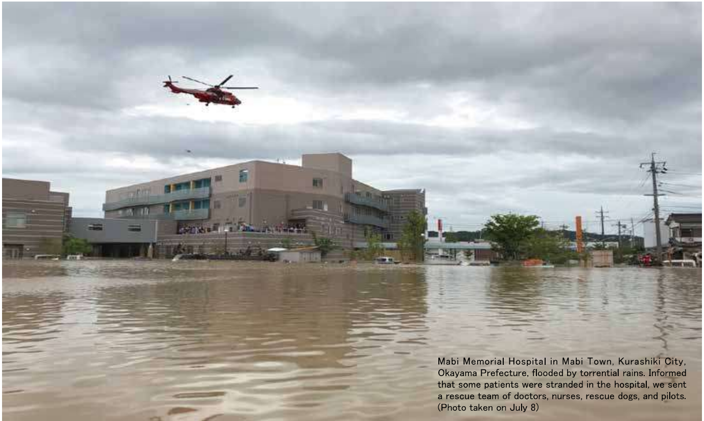
Mabi Memorial Hospital in Mabi Town, Kurashiki City, Okayama Prefecture, flooded by torrential rains. Informed that some patients were stranded in the hospital, we sent a rescue team of doctors, nurses, rescue dogs, and pilots. (Photo taken on July 8)