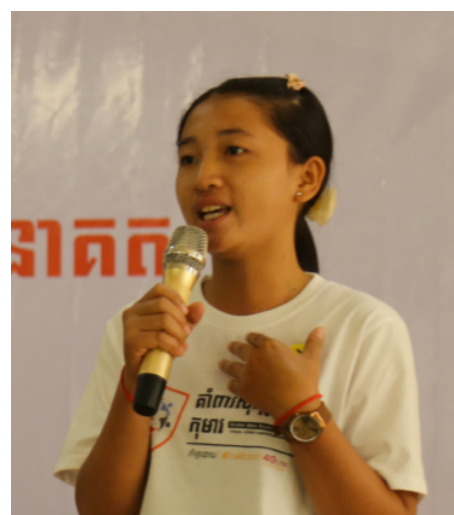
Our child volunteers advocated for better child protection through awareness raising campaigns