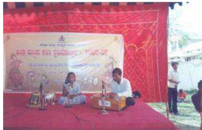
Kids Participating in District level Light vocal competition