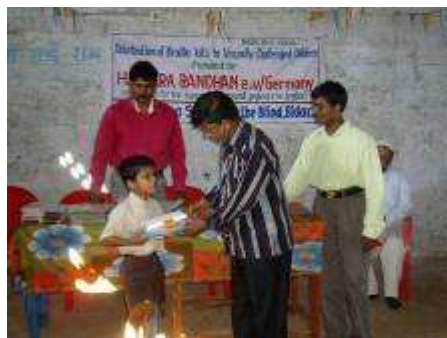
Braille Kit distribution to ADSFB kids