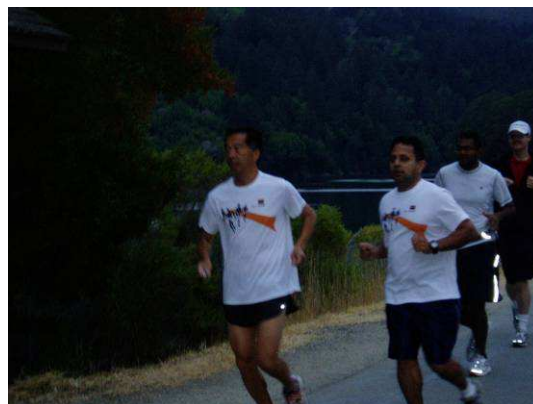
All set to Run Half Marathon- Team Asha-SV