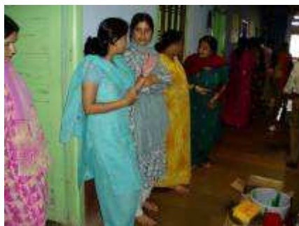
AFFWA Member visited school