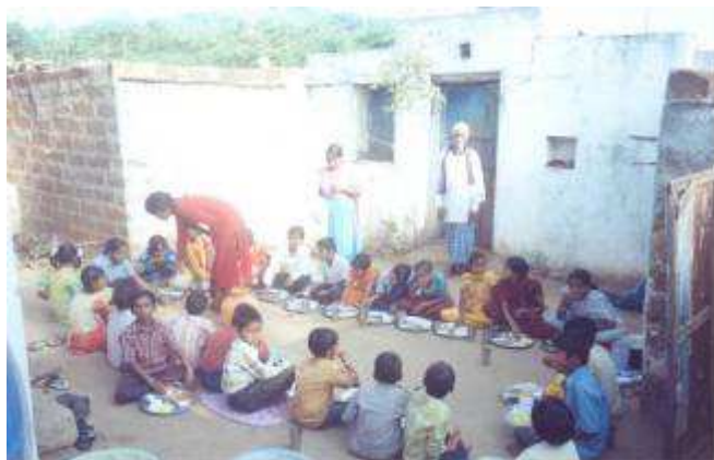
Children of Asha Kirana Centre