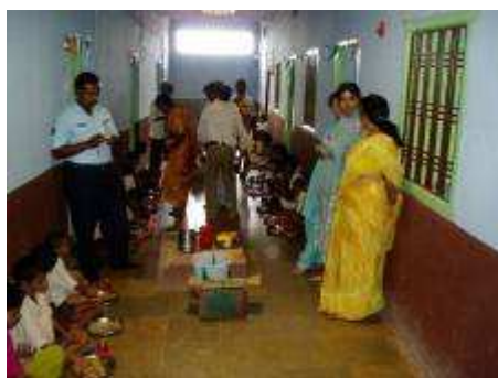
AFFWA sponsored special meal on republic day