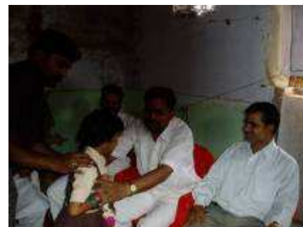
Visitor honor school kid on her performance