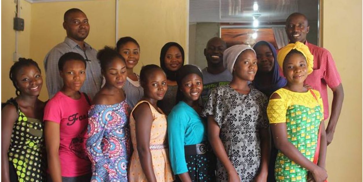
Empowerment Seminar March 2018