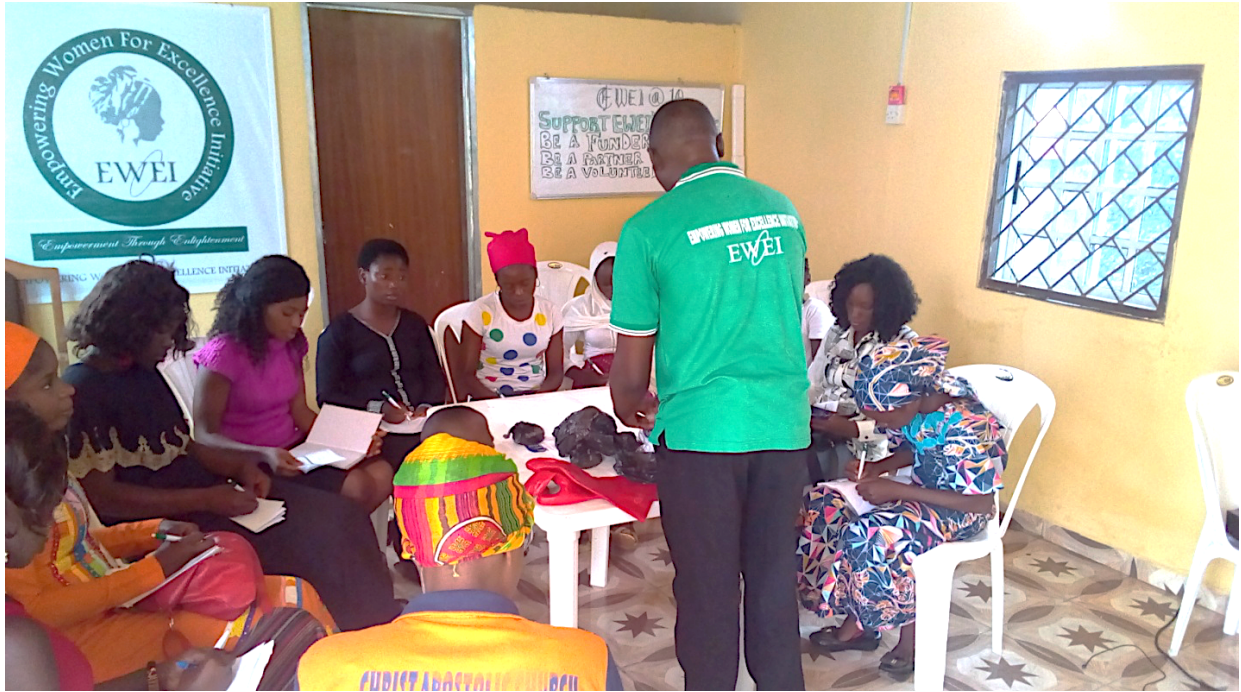
ESP Empowerment Seminar September 2018