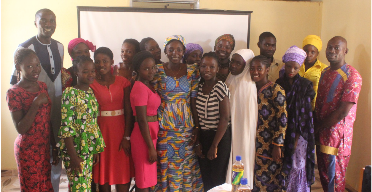
Empowerment Seminar June 2018