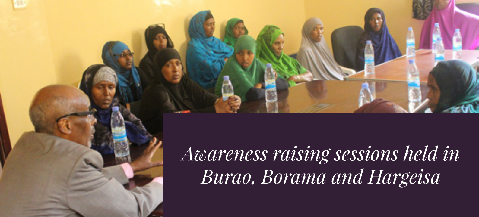
Awareness raising sessions held in Burao, Borama and Hargeisa