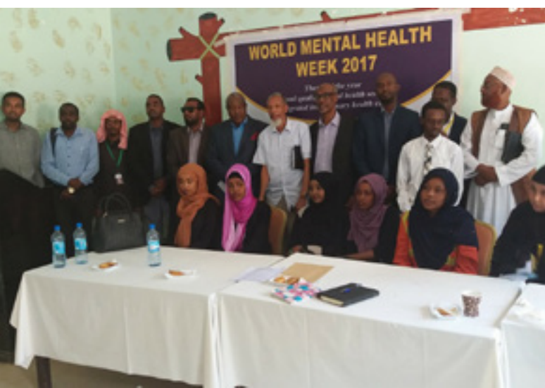
World Mental Health Week organised by SMHSO