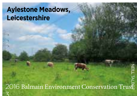
Aylestone Meadows, Leicestershire