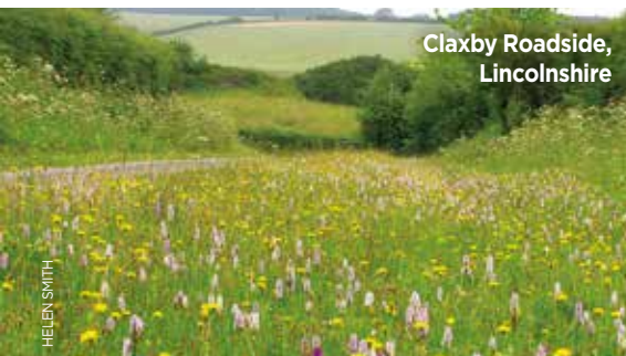
Claxby Roadside, Lincolnshire