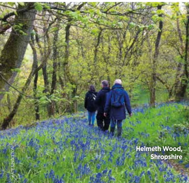
Helmeth Wood, Shropshire