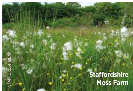
Staffordshire Moss Farm