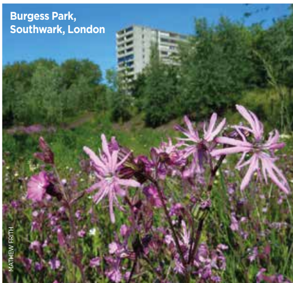
Burgess Park, Southwark, London