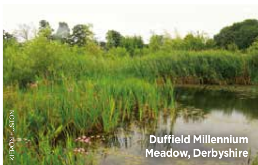
Duffield Millennium Meadow, Derbyshire