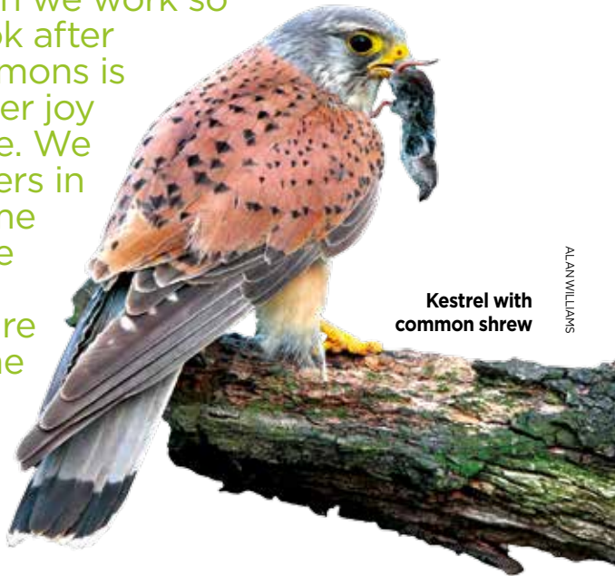
Kestrel with common shrew