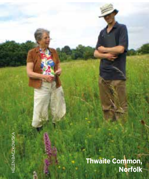
Thwaite Common, Norfolk