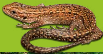
Hoe Common, Norfolk