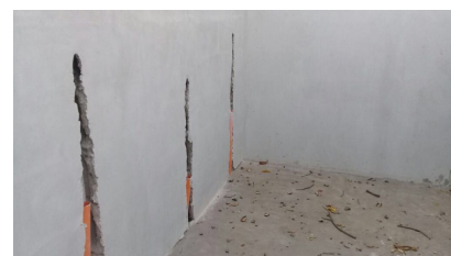
Installation is ready to locate devices.