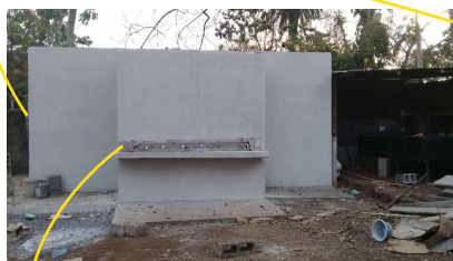
All the walls are built.