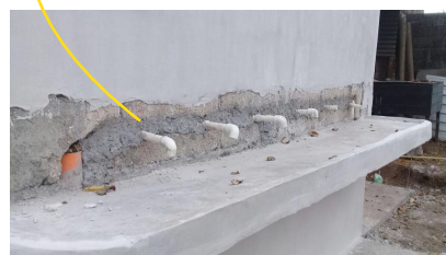
It is planned to have five handwash stations for simultaneous use.