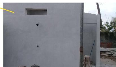
The outside wall will have an attached shower.