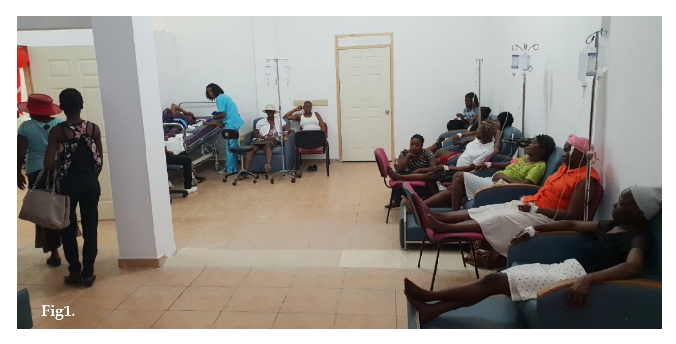
Fig1. This is IHI's chemotherapy room where our breast cancer patients receive their treatment.