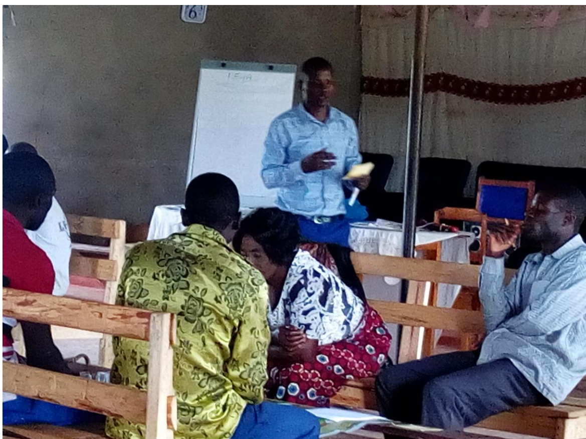
Farmers business Simulation training

Teacher's expenses for the Month of January 2020