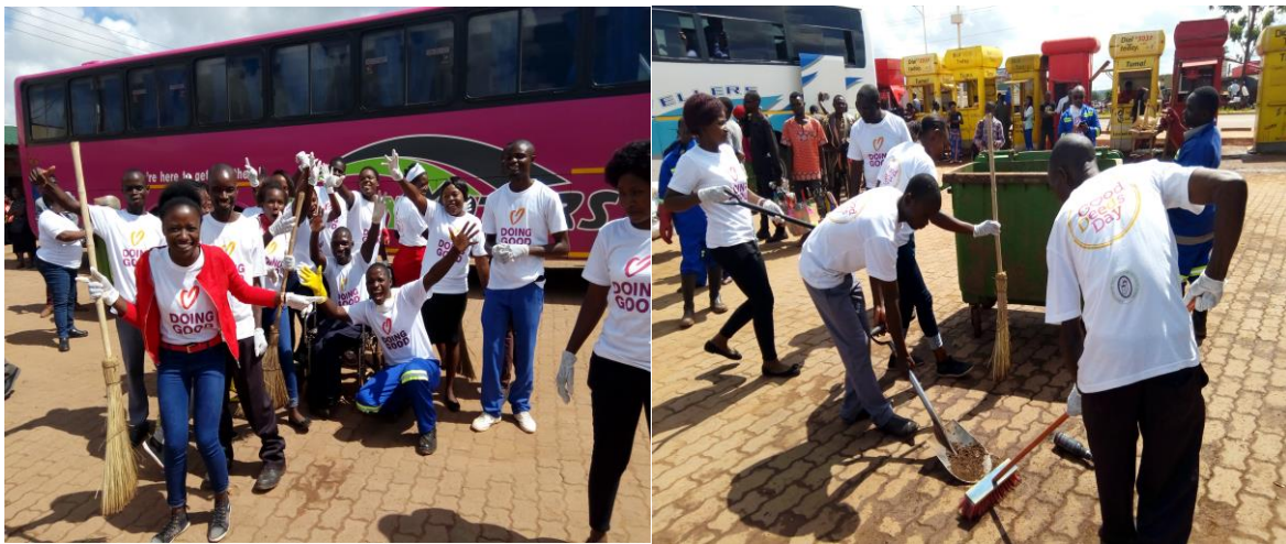
Public cleaning at Solwezi Main station

In March 2020, Charity Centre for Children and Youth Development joined other organization from around the world to celebrate Good Deeds Day. In line with the same, the organization offered several activities from public cleaning, offer of free internet and providing food to vulnerable families in Zambia. This is a simple act of doing good for humanity and the environment. This was also a response to the COVI-19 that has affected the whole world.