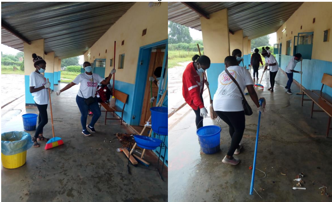
Cleaning at Solwezi Urban Clinic (Community Service)