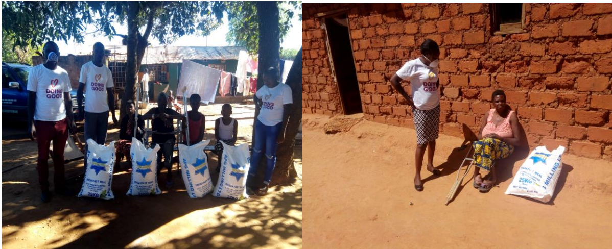
Doing good by helping vulnerable people with food during COVID-19 emergency response