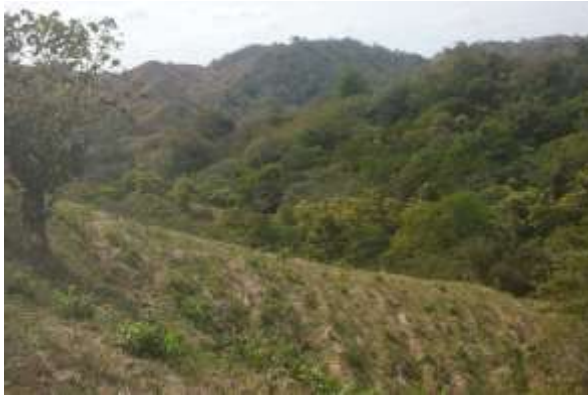
A recently-planted plantation of mixed native species near a patch of remaining native forest created by the Azuero Earth Project in 2014.