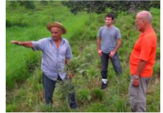
A producer from past years participates actively in planning the reforested parcel, explaining the characteristics of his farm to the Azuero Earth Project team.