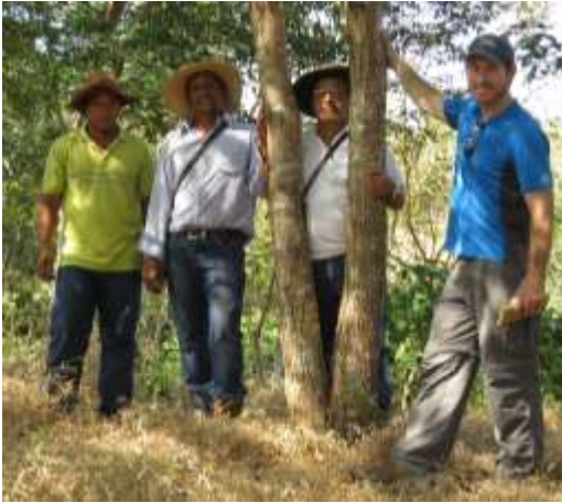
Program staff from past years in the field for a data collection trip.