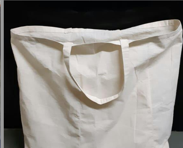
Vegetable Bag/Departmental Bags