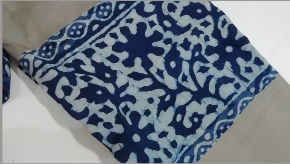
Yoga Mat Cover with new pattern