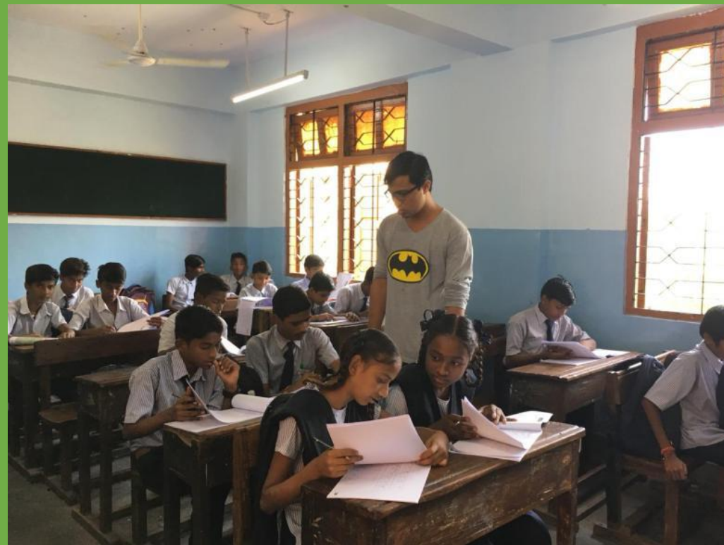
CareerAware at Malwani Municipal School