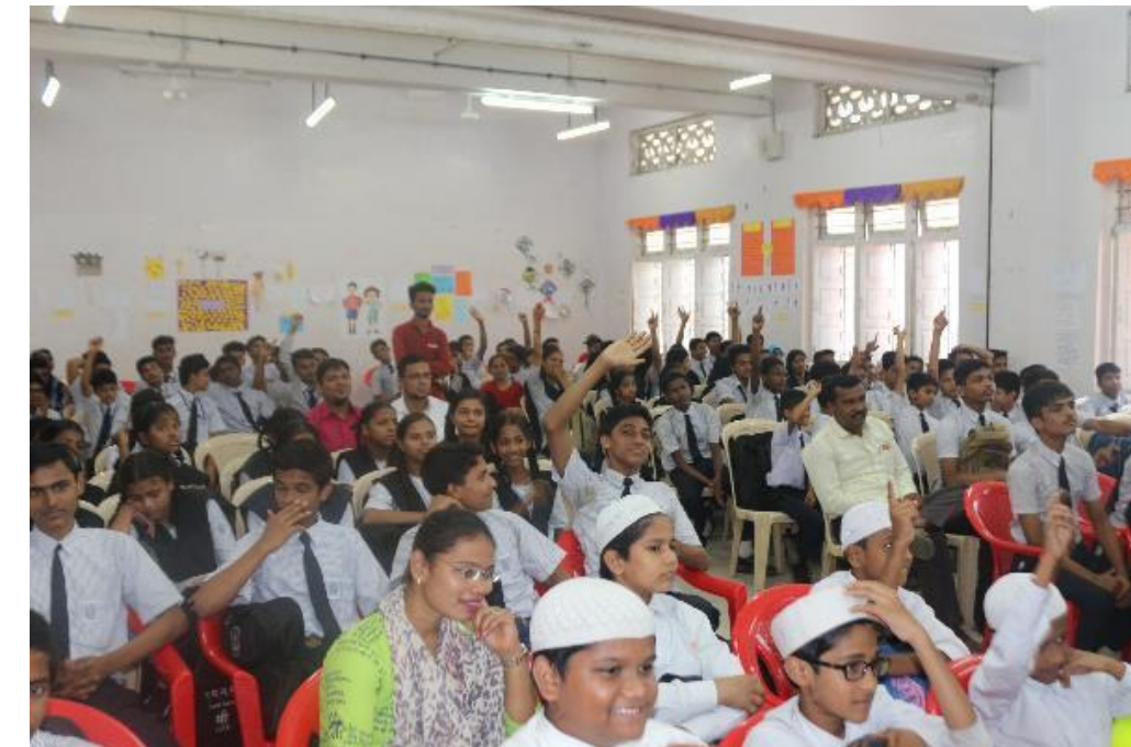
Students and school staff at a ward level event

CareerAware orientations attended by 100 headmasters