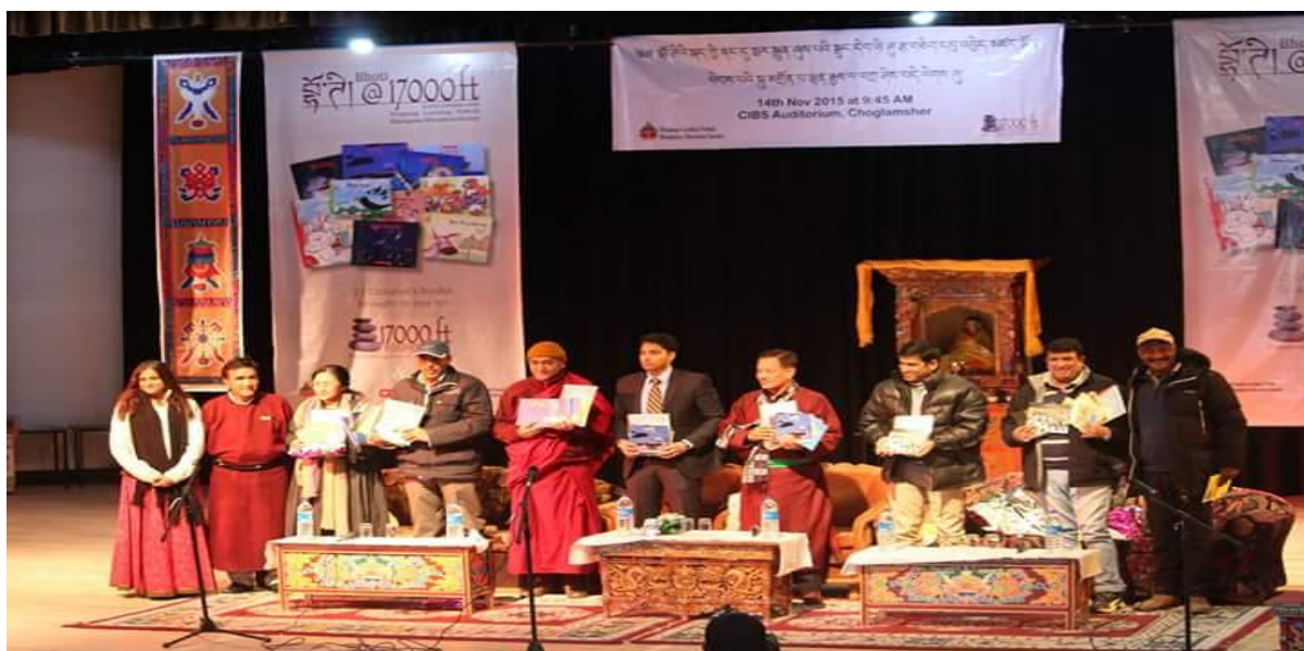
Launch event of the Bhoti Books in 2015

Ever since its inception, 17000 ft Foundation has been tirelessly working to create a culture of reading in Ladakh, by setting up libraries across hundreds of schools in remote areas. In a region where the only books available to read were either religious texts or travel books, the presence of hundreds of books in each school opened up a world of imagination and discovery for these children. Even though, 17000ft was providing books and libraries to the remote schools of Ladakh, story books in local language (Bhoti) were missing from these libraries due to unavailability of story books in Bhoti language. However, in 2015, after two years of hard work and dedication, 17000 ft was able to provide the children of Ladakh with the joy of reading in their own language, when it successfully translated 20 of the most iconic stories from Pratham Books and Scholastic into Bhoti language and distributed more than 20,000 copies in over 300 schools of Leh district, a historic first in the region.