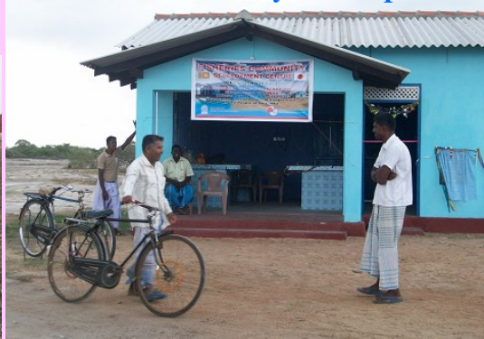
Fisheries Community Development Center

And we have more needs as though you couldn't fulfill all those needs we strongly expect you will do what you can. I pray for prosperous life to Japan benevolent Peoples, your organization and staffs as you are working hard on the great purpose on people to accomplish their needs and rights.