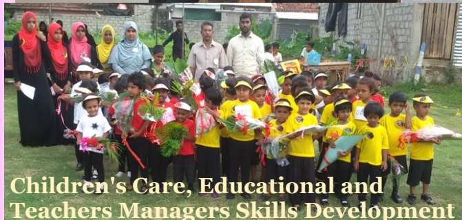
Children's Care, Educational and Teachers Managers Skills Development