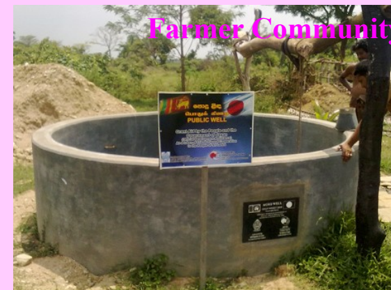
Farmer Community Development Project