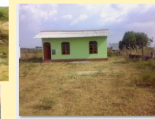
Manirasan kulam Center