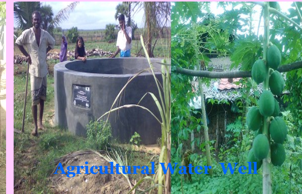
Agricultural Water Well