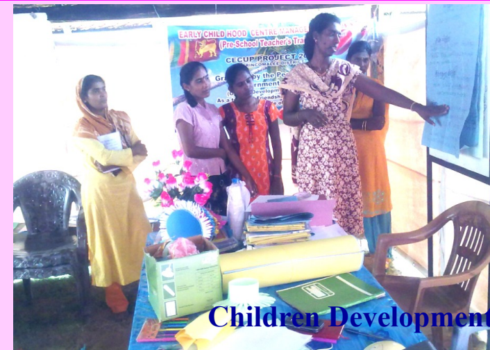
Children Development, Care, Educational Project

“We have fulfilled many duties in the rural villages. We have Helping Poor. And we coordinating to peace, creating their self confidence in each others and solidarity.”