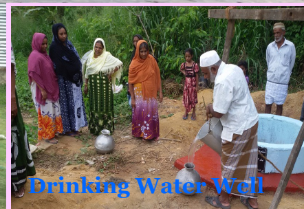
Drinking Water Well