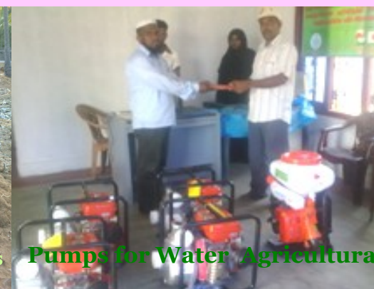
Pumps for Water Agricultural