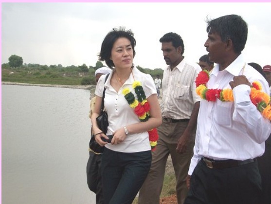
Lake / Pond