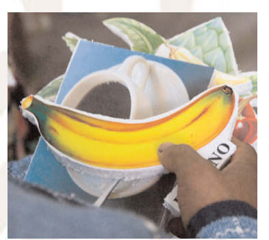
HEALTH WORKSHOPS: LEARNING ABOUT FOOD GROUPS

$25 buys books for the little girls' Spanish literacy class